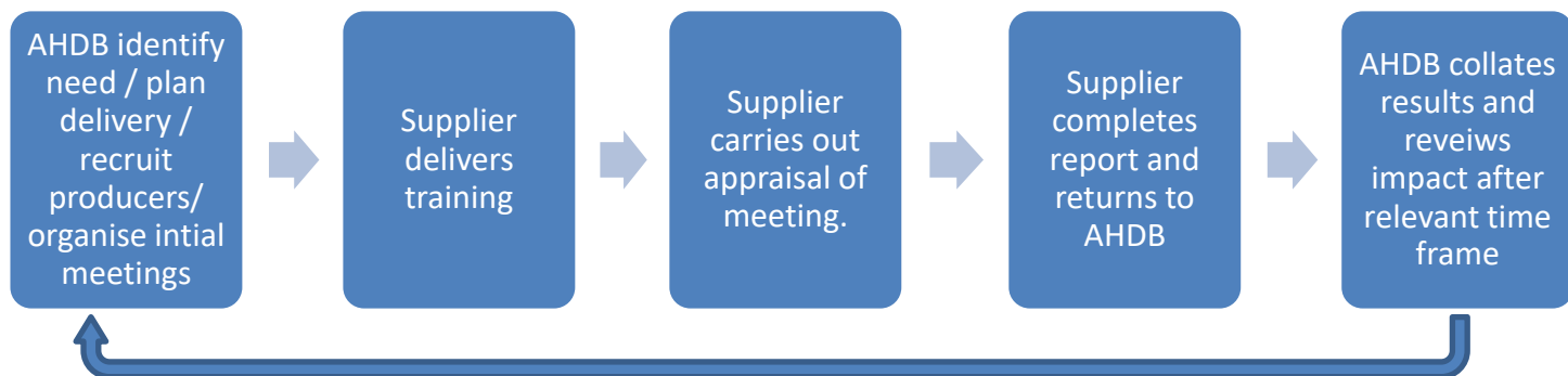
Figure 1 – Training Delivery Process

Training shall be delivered by the Supplier to AHDB by following the Training Delivery Process within Figure 1.