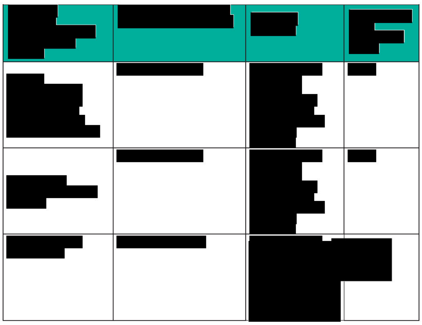
Table 2 Types of Information that the Potential Provider considers to be Commercially Sensitive

Joint Schedule 4 (Commercially Sensitive Information) Crown Copyright 2021