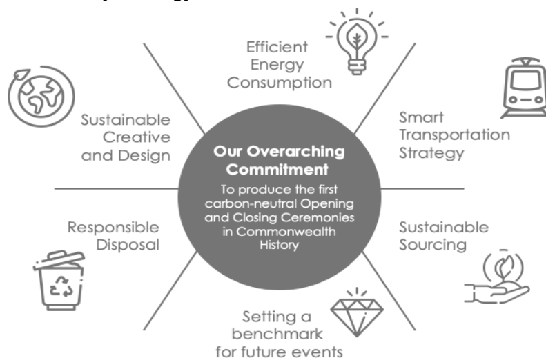
Figure 2: BCL Sustainability Strategy

We will prioritize suppliers who can demonstrate sustainability best practice within their own organisation.