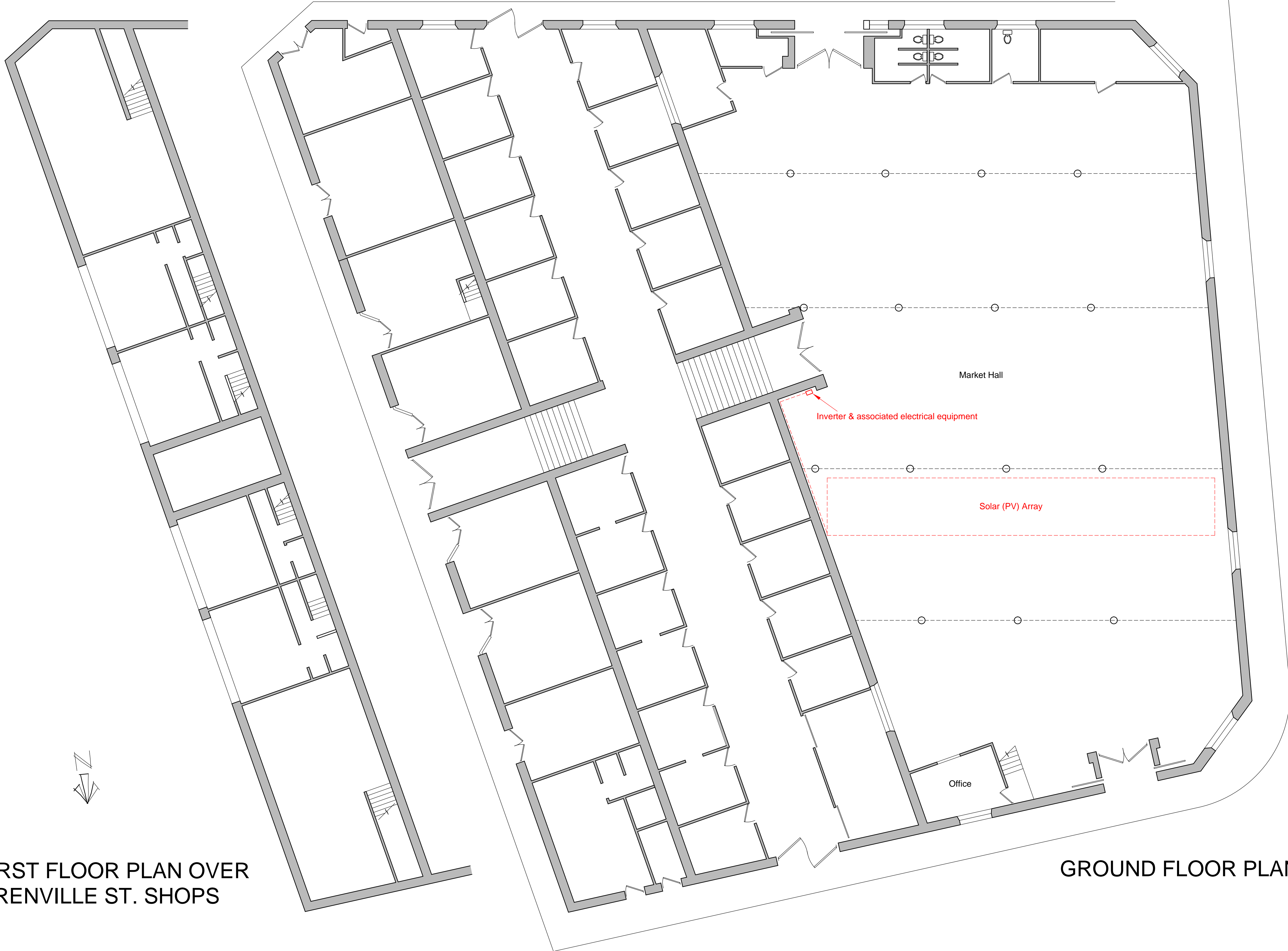
FIRST FLOOR PLAN OVER GRENVILLE ST. SHOPS