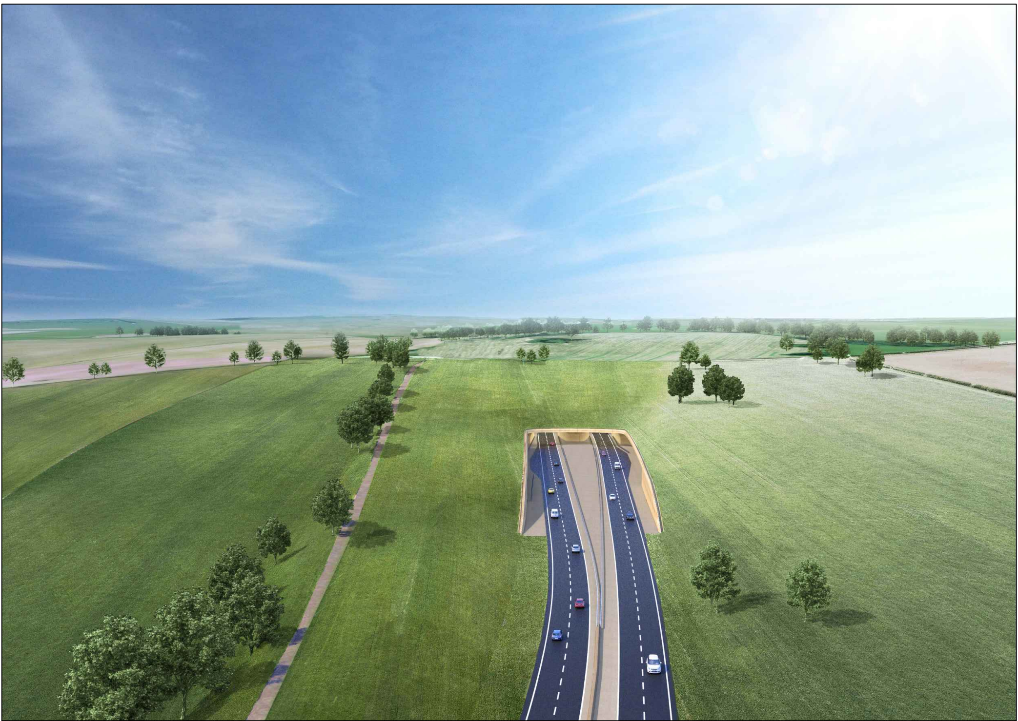
AERIAL VIEW OF TUNNEL ENTRANCE (AERIAL VIEW 1) AERIAL VIEW ILLUSTRATION AS REPLICATED FROM OEMP