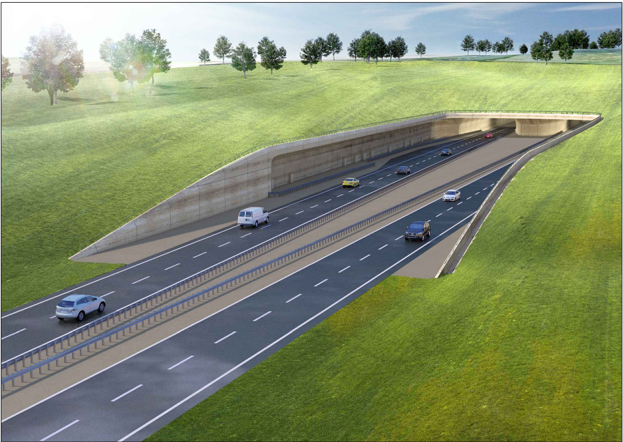
AERIAL VIEW OF TUNNEL ENTRANCE (AERIAL VIEW 2) AERIAL VIEW ILLUSTRATION AS REPLICATED FROM OEMP