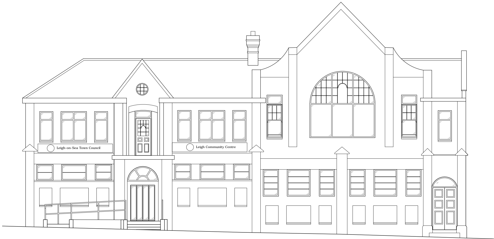
FRONT ELEVATION (EAST) SCALE 1:100 0 1 2 3 4 5m

General Notes: Do not scale this drawing. Work to figured dimensions only. This drawing is copyright of THS Concepts and should only be reproduced with their express permission. Check all dimensions on site. Any discrepancies should be reported to THS Concepts prior to commencement.