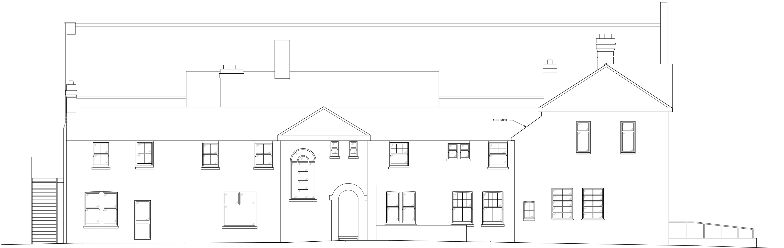
SIDE ELEVATION (SOUTH) SCALE 1:100 0 1 2 3 4 5m