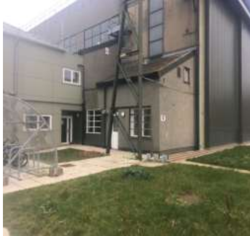
Figure 1 - External access view at RAF Benson