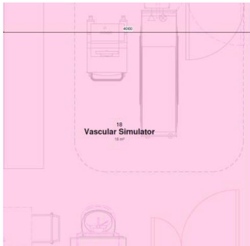
Example floor plan