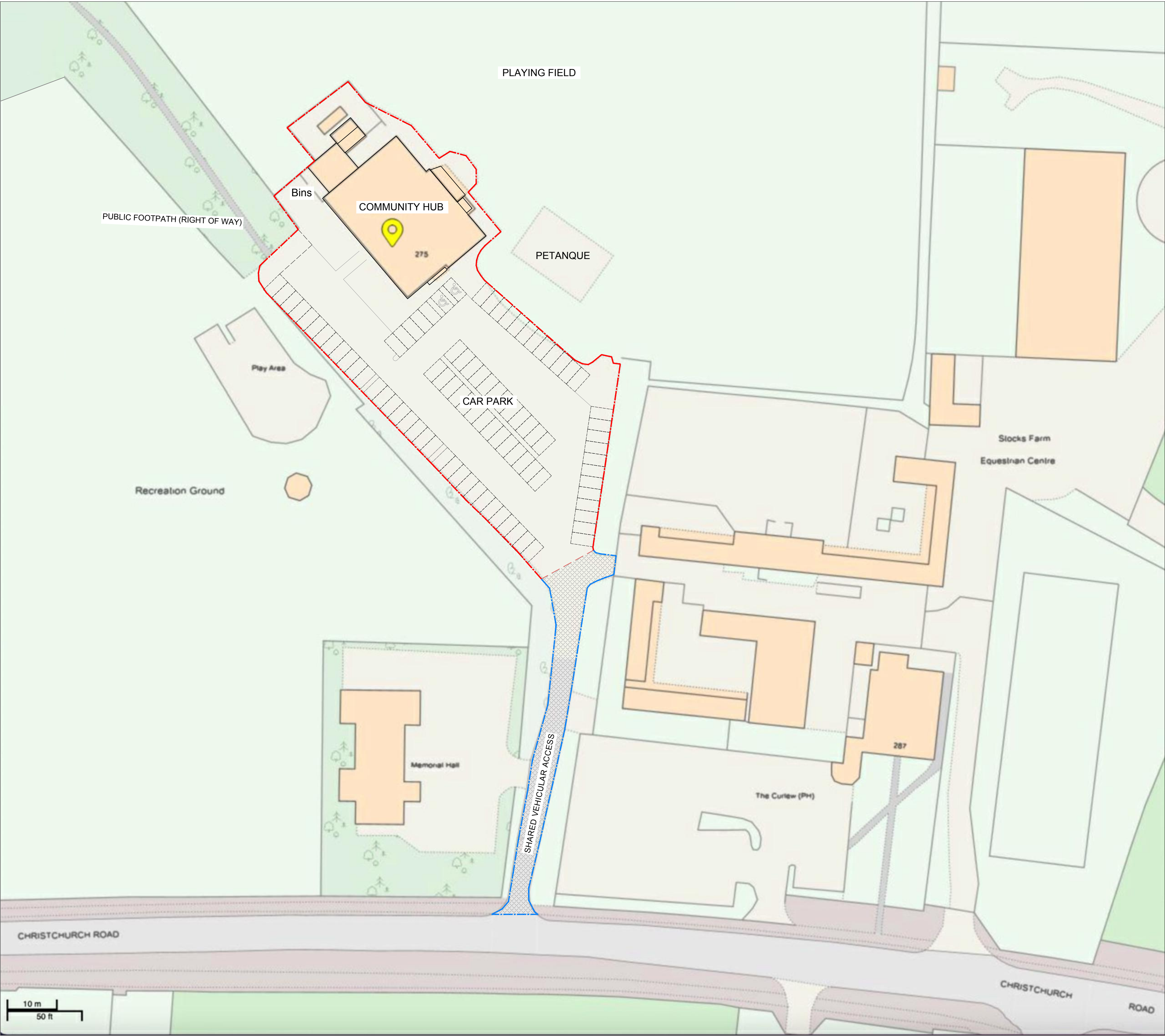
ENLARGED BLOCK PLAN SCALE: 1:500 @ A1