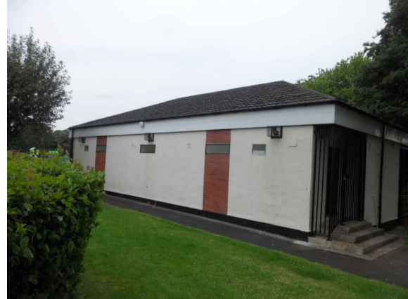
The Pavilion Reburishment

Hyde Road, Upper Stratton, Swindon, SN2 7RB Tel: 01793 835 765 Fax: 01793 825 725 Email: enquires@edmont.co.uk Web: www.edmont.co.uk