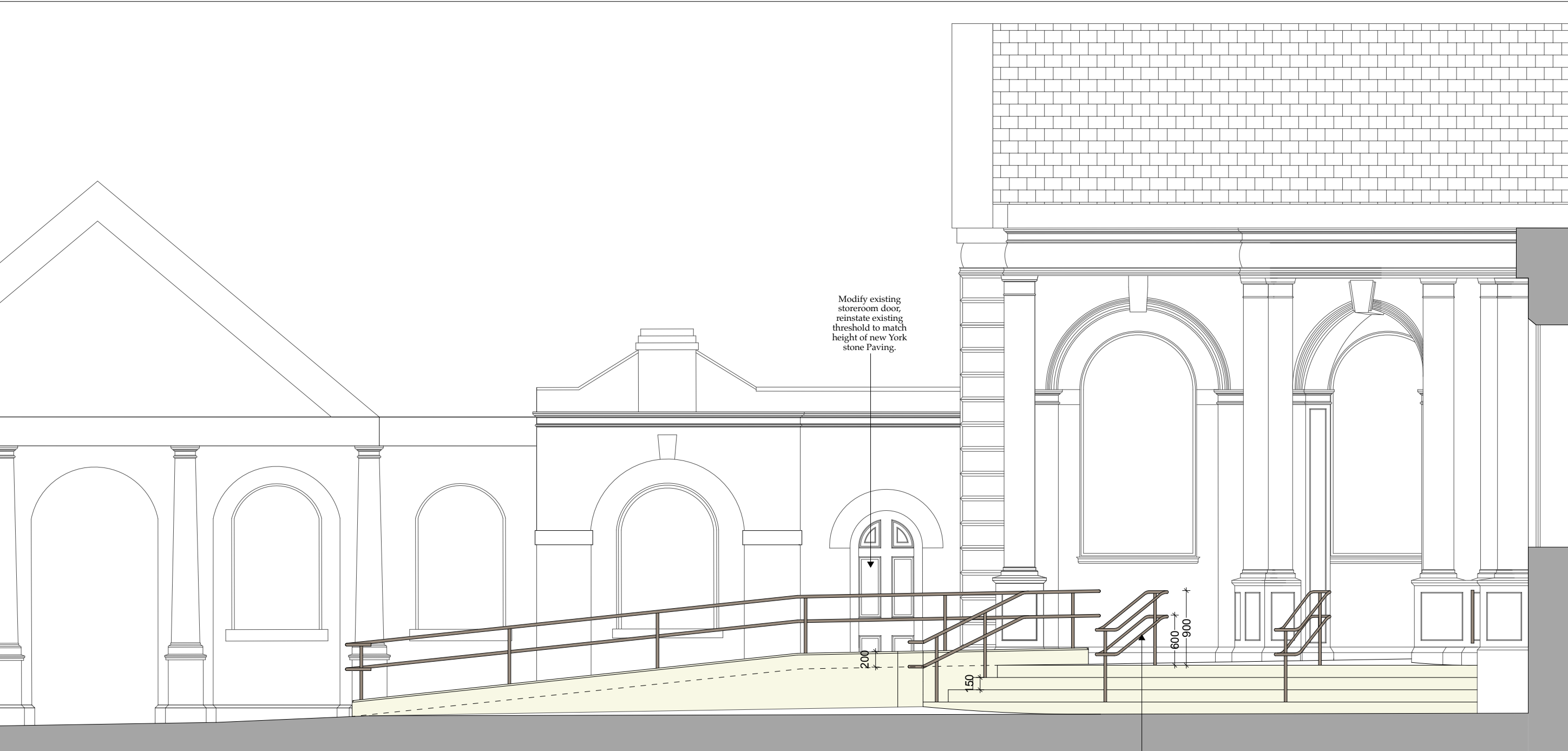
Proposed North Elevation - 1:50 To be read in conjunction with drawing 707/5.1.1