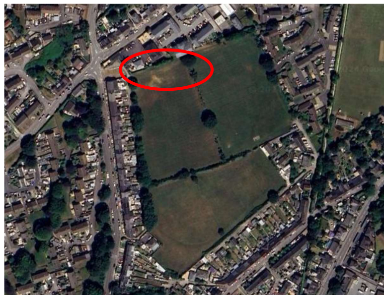
Figure 1. Aerial Photo showing proposed site.

The aerial photograph below shows the approximate proposed location for the building.