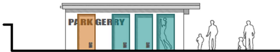
Figure 4. Proposed West Elevation.

The elevation above shows the main south elevation which we are proposing will be finished in corrugated metal sheet cladding, with bright powder coated doors with signage to reflect the design and characteristics of the rest of the designed landscape.