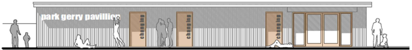
Figure 3. Proposed South Elevation

The elevation above shows the main south elevation which we are proposing will be finished in corrugated metal sheet cladding, with bright powder coated doors with signage to reflect the design and characteristics of the rest of the designed landscape.