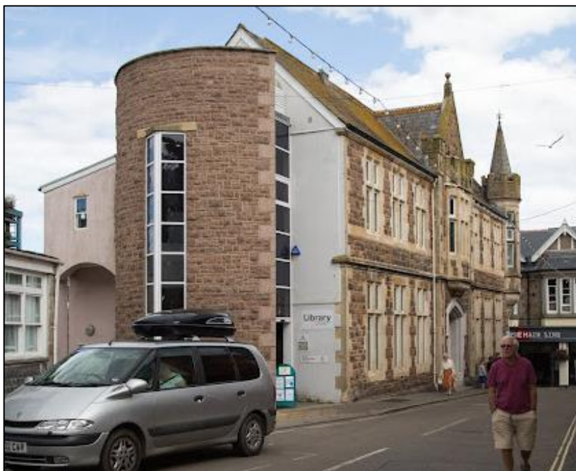
Figure 1: View of the Library from the west.

The building is of traditional stone construction dating from 1896 with a more recent addition to the western end of the building (Figure 1). The building abuts the pavement and has no grounds adjacent to it.