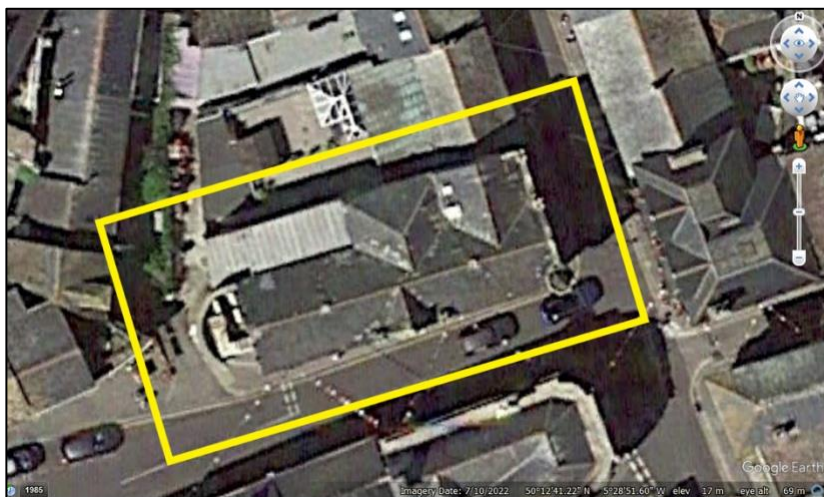
Figure 4: Aerial view of the Library showing the existing HVAC outdoor units.

The existing Fujitsu outdoor units are roof mounted and can be seen in Figure 4. Areas of the roof are assigned for solar PV modules – which are now installed, but some roof space will be viable for HVAC type units.