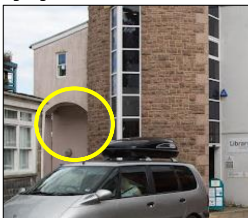
Figure 5: Service entrance with potential overhead space for an outdoor unit.

There is a service entrance at the western end of the building with a high arch alcove. There is some space above head height that might suit the installation of a wall mounted or platform mounted, outdoor unit. Figure 5 shows this space highlighted.