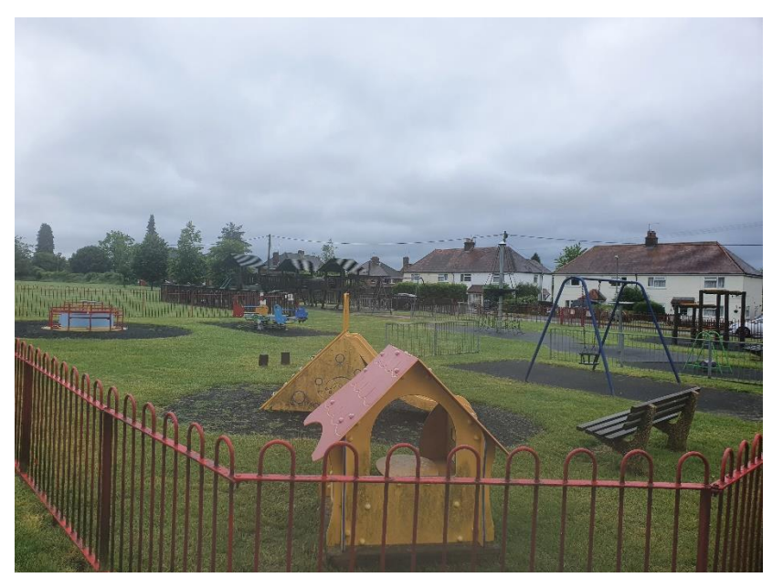
Playground at Stratton Bates Recreation Ground as it is presently

The playground at Stratton Bates Recreation Ground is currently located on flat ground in the north west corner of the park and is currently approximately 1000 msq. Much of the existing equipment has gone beyond its expected lifespan and the result is a tired and somewhat uncoordinated playground. An additional problem identified with the current design at Stratton Bates is that it is too open and can result in an unsafe feeling.