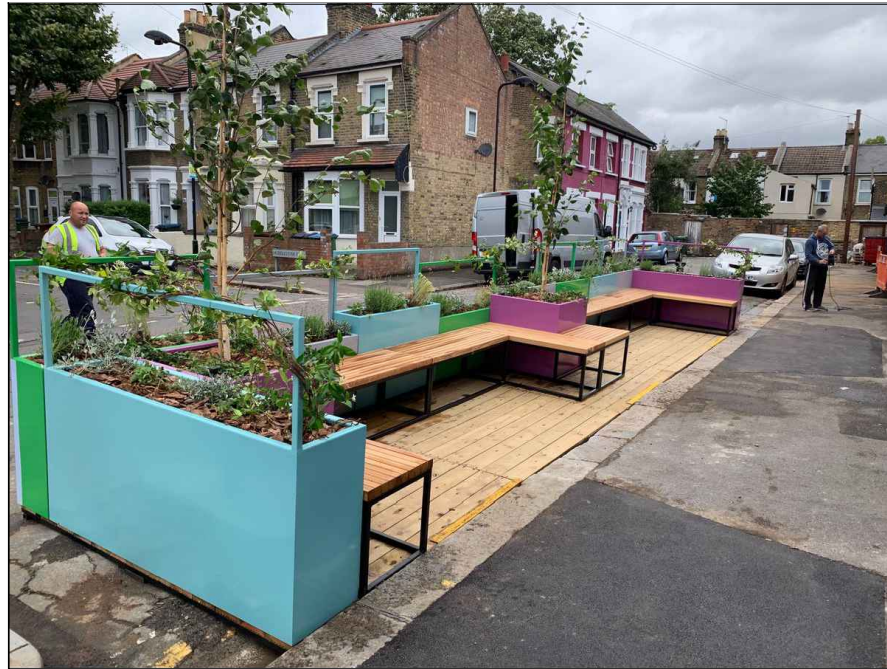
Parklet example opposite a residential side road