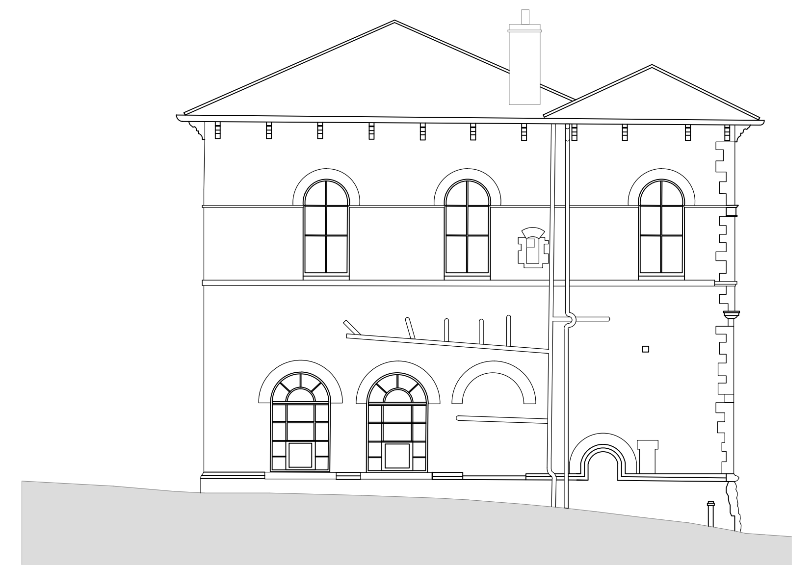
existing side (south east) elevation - scale 1:100