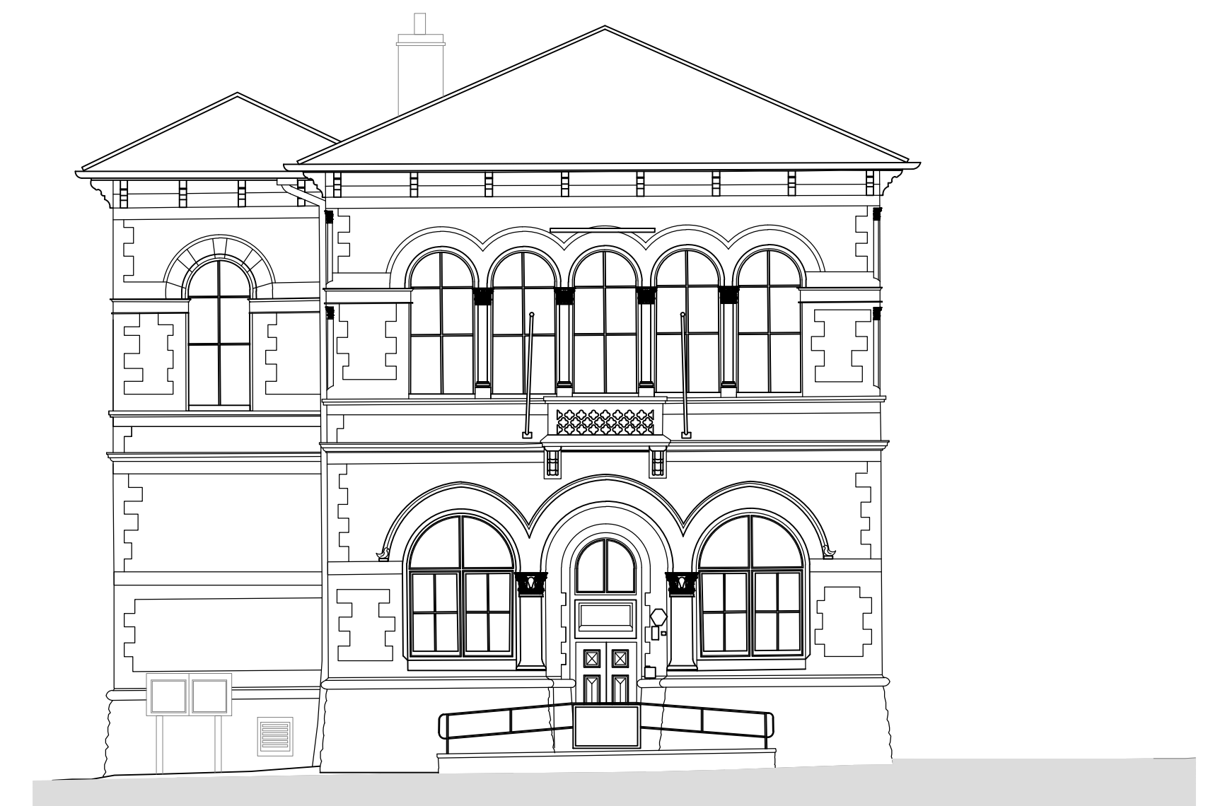
proposed side (north west) elevation - scale 1:100