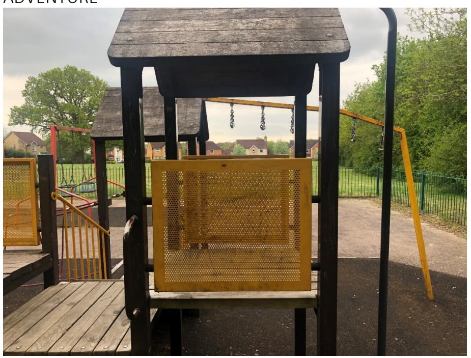
MULTI ACTIVITY UNIT PLAYGROUNDS 6-10 ACTIVITES KIDDIE KABIN-YORK ADVENTURE