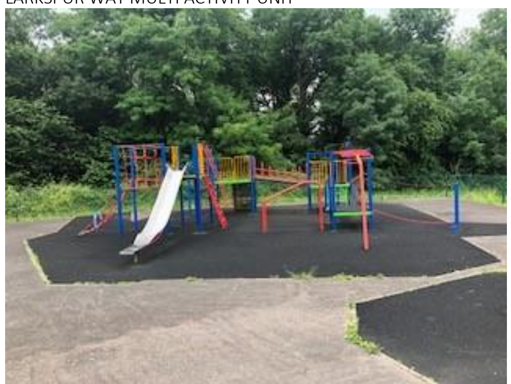
LARKSPUR WAY MULTI ACTIVITY UNIT