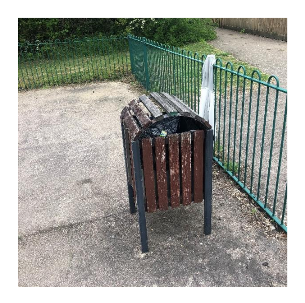
NUTHAM LANE BENCH