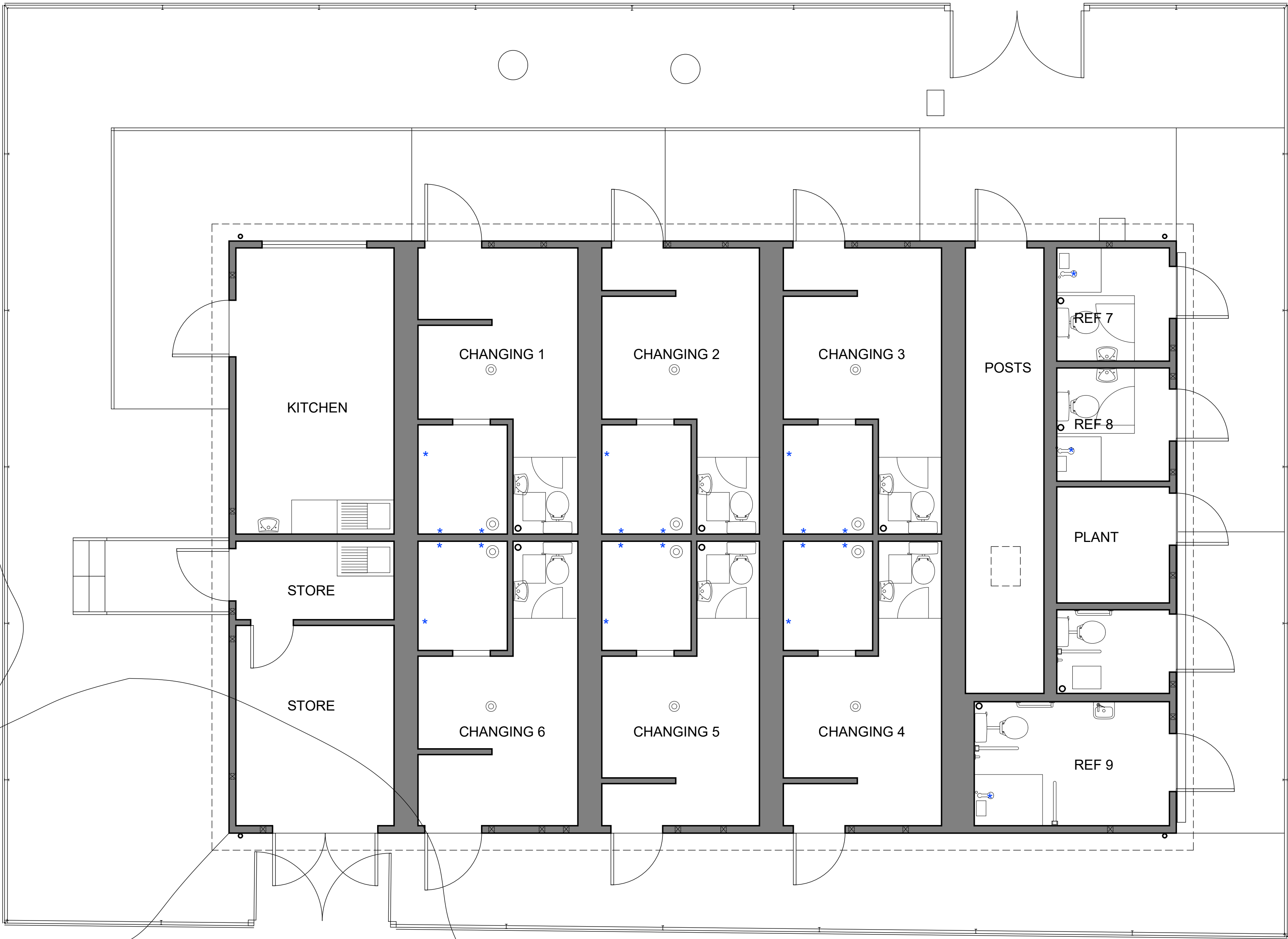
Ground Floor Plan - As Existing 1:50