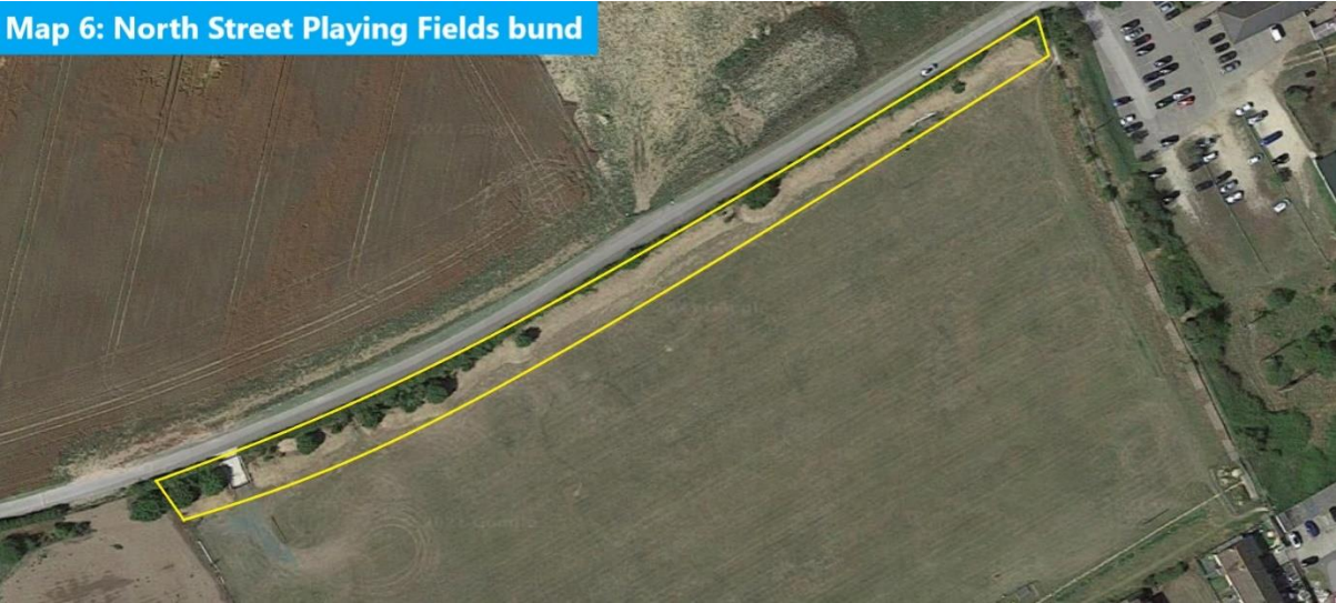
Map 6: North Street Playing Fields bund