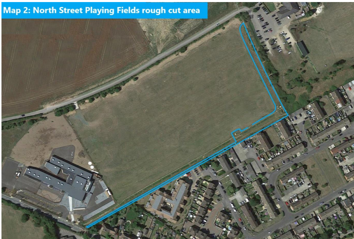
Map 2: North Street Playing Fields rough cut area