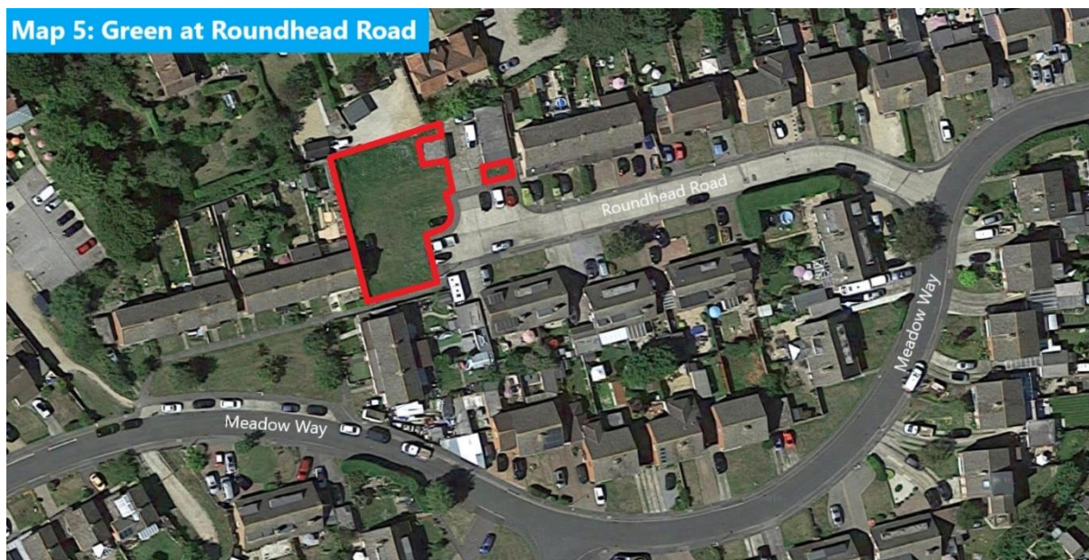
Map 5: Green at Roundhead Road