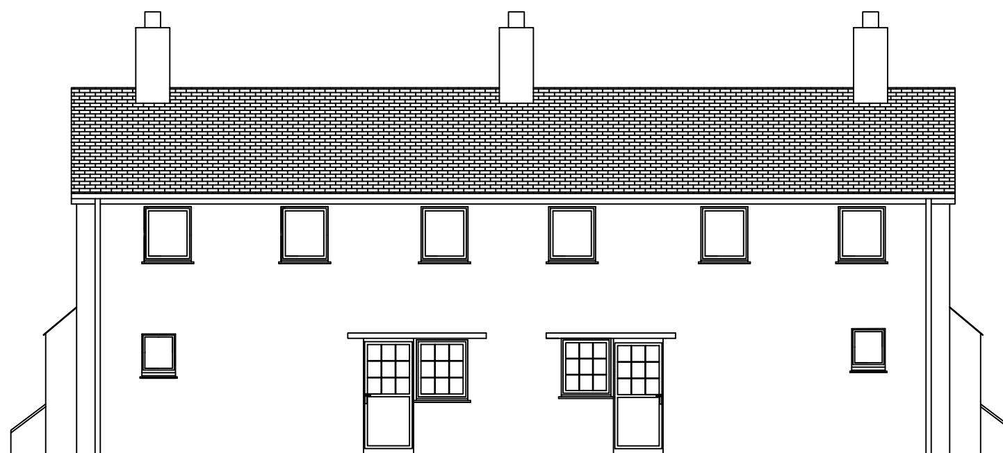
South Elevation Proposed

Currie & Brown Meridian House Heron Way, Truro, TR1 2XN, United Kingdom Tel: 01872 306038 www.curriebrown.com