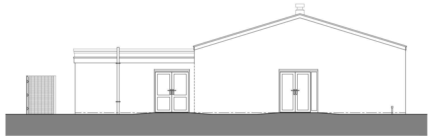
WEST (SIDE) ELEVATION AS EXISTING 1:100