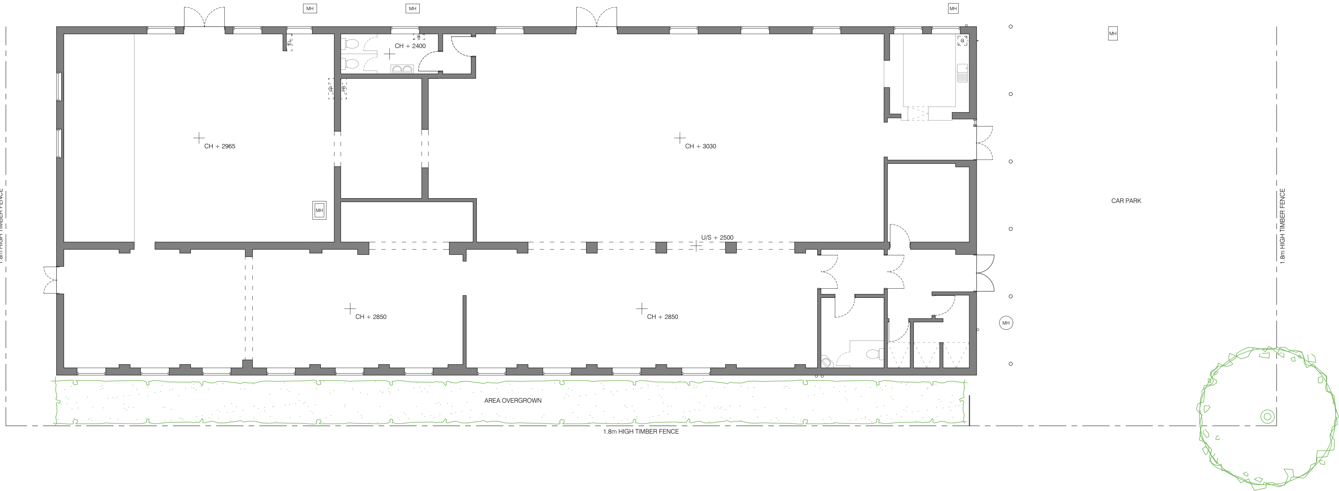
PLAN AS EXISTING 1:100