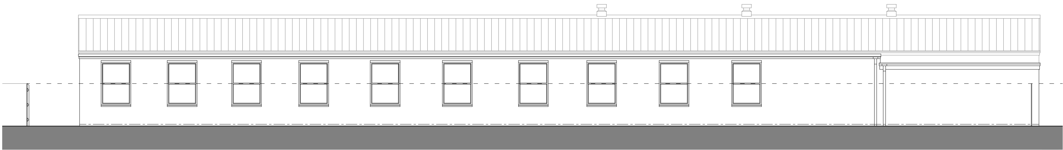
SOUTH (REAR) ELEVATION AS EXISTING 1:100

PROJECT CHANGE OF USE TO RESIDENTIAL FLATS