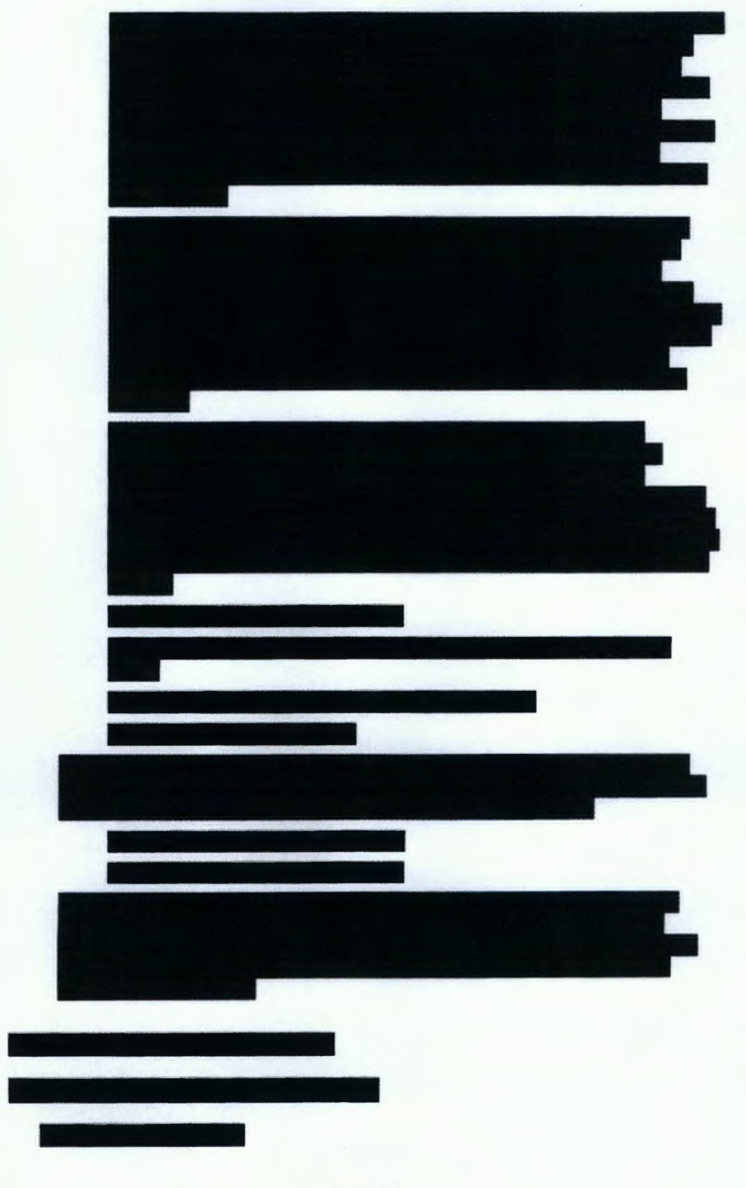
Page 4 of 31