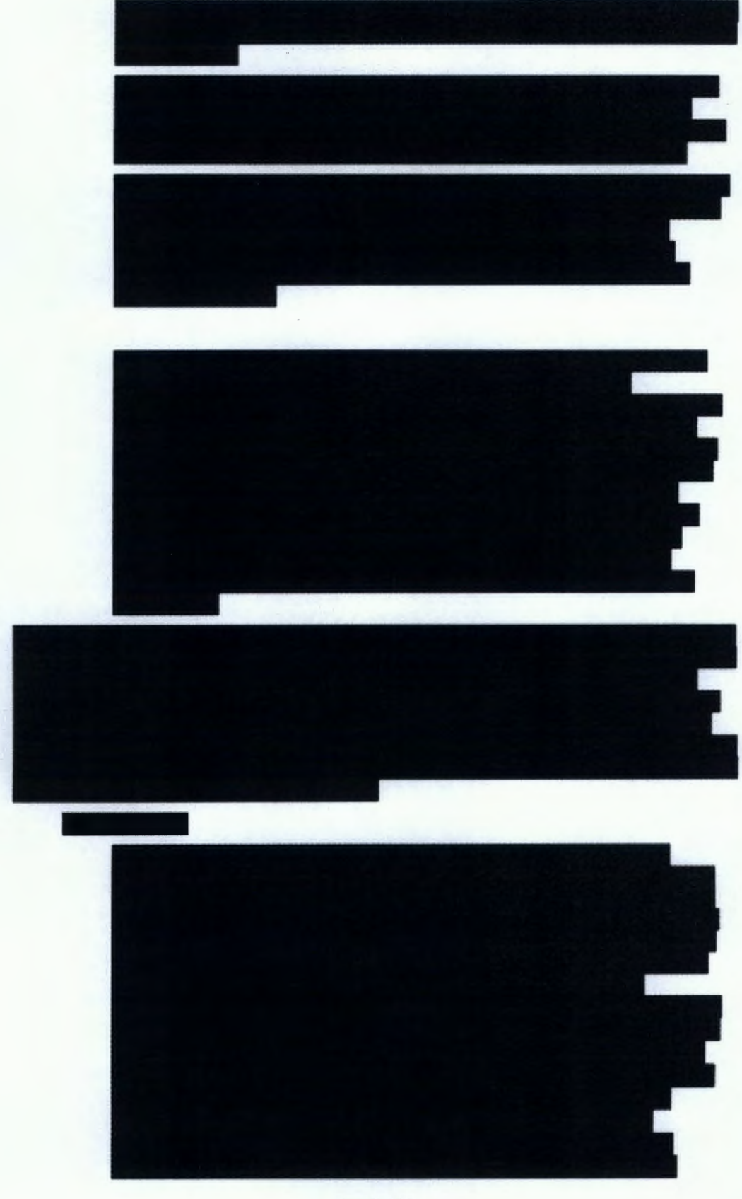
Page 3 of 31 OFFICIAL-SENSITIVE-COMMERCIAL