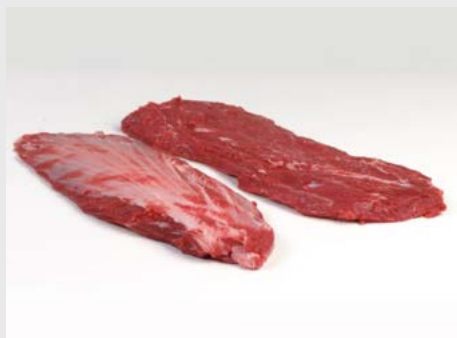
5. Separate the feather into two parts by carefully cutting on and along the central gristle sheath.