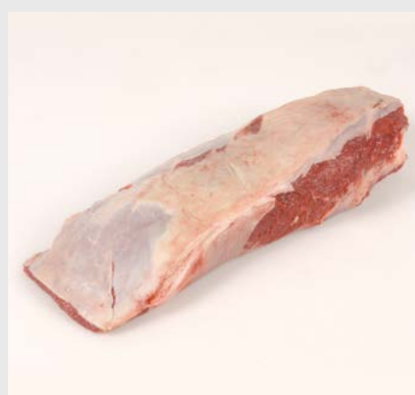
2. Untrimmed feather muscle.