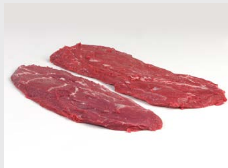
6. Remove the gristle sheath.