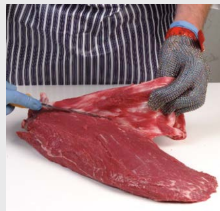
3. Remove all visible external fat and gristle.