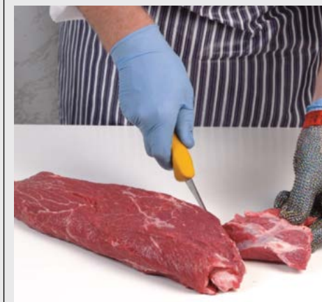
4. Remove the muscle and gristle at the anterior end of the feather muscle.