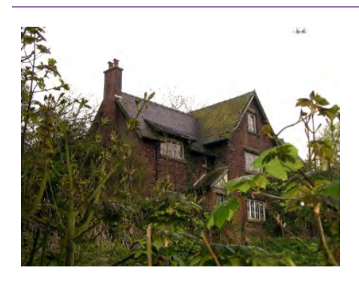
Limekiln Farm Limekiln Farm Lane CW12 3NU

An imposing farmhouse in the Arts and Crafts style. Red brick in stretcher bond with a blue plain tile roof in poor condition. Sills, lintels and plinth in stone. Whilst not of great historical value, the house is of unusual character for the area and a makes a significant contribution to the landscape.