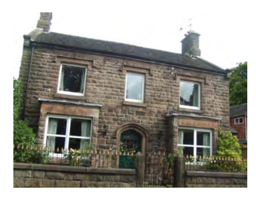
87 Stone House Leek Road CW12 3HX

Two storey square plan, well presented stone cottage. Mid Victorian detached house, stone hood mouldings to front façade, ground floor bay windows either side of front door,