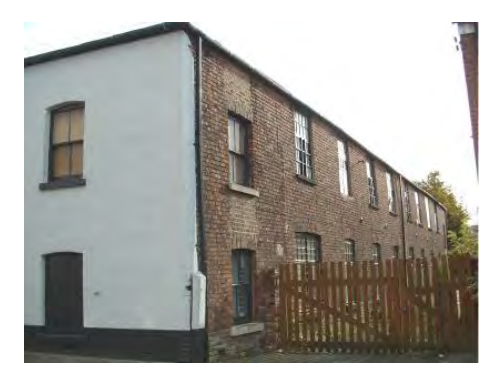
Dale Street Mill 14-26 Dale Street SK10 1NH

Dale Street Mill has a history of Chemical and Textile works, of mid-late 19th century origins. It consists of brick with rendered front, timber sash windows with gauged and rubbed flat arch brickwork and stone sills. Last remaining aspect of the Borough's Industrial heritage in the area, contributes greatly to the local streetscene.