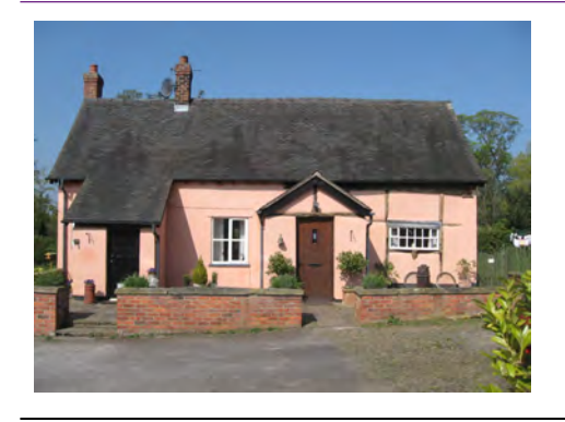
Dubthorn Watery Lane CW12 4RR

Small-framed farmhouse with more recent brick additions. Rendered with some frame elements exposed. Blue plain tile roof and brick chimneys.