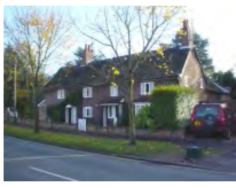
105-10 Knutsford Road SK9 6JP

Early 19th century dwelling with many original features, including window casements. Rendered with a slate roof.