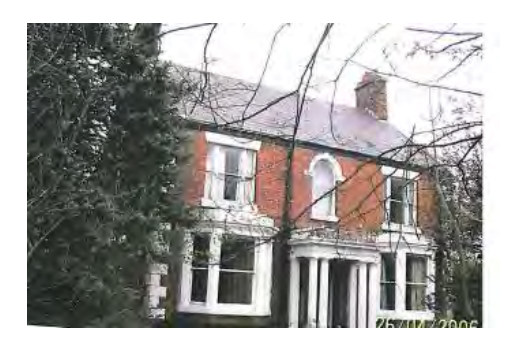
The Limes 425 Crewe Road

A fine detached Victoria Villa, constructed in 1871 of brick. Has white painted detailing and bay windows flanking its central open door portico. Built for Baptist Church adjacent. Good example of 19th century domestic architecture. Contributes positively to the frontage of Crewe Road.