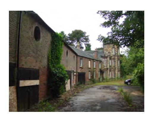
Mossley House Biddulph Road CW12