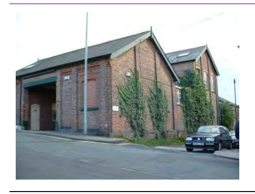
The Old Stables Brook Street SK11 7AA

The Old Stables are constructed of brick with a slate roof and dormer windows. They were used as a depot for the Co-op dairies for many years.