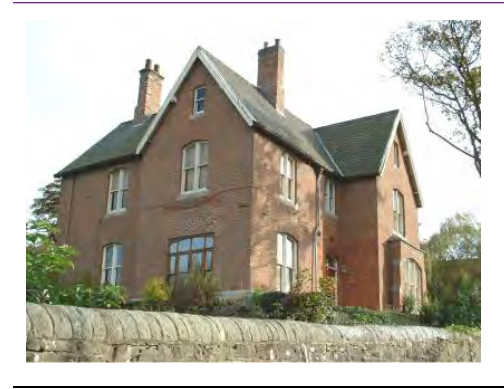
The Old Vicarage 58 Blakelow Road SK11 7ED

A large Victorian vicarage featuring some lovely detailing, in Gothic style.