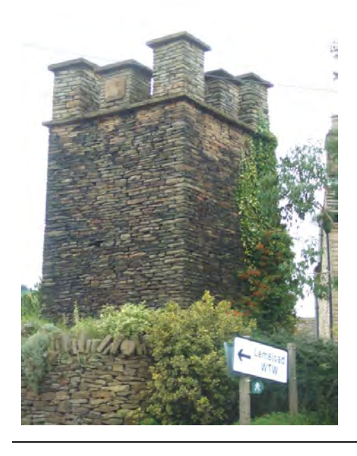
The Tower Tower Hill SK10 5TX

The structure is within the grounds of Tower Hill House. The Tower appears on the 1870 OS map, the exact date and original function unknown. A notable, well known landmark located in a prominent position on Tower Hill.