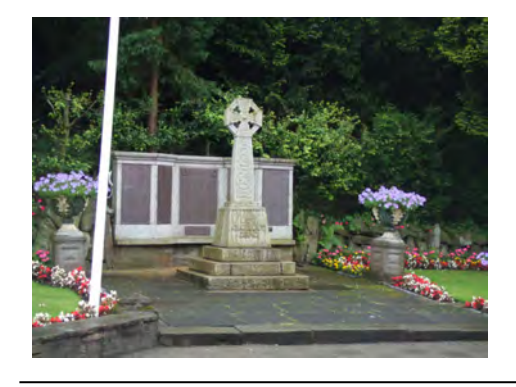
War Memorial Lawton Street

Former 19th century silk ribbon mill, extensive restoration 2004. The textile industry was the major activity in succeeding decades; the mill is a lasting reminder of social and economic history in Congleton.