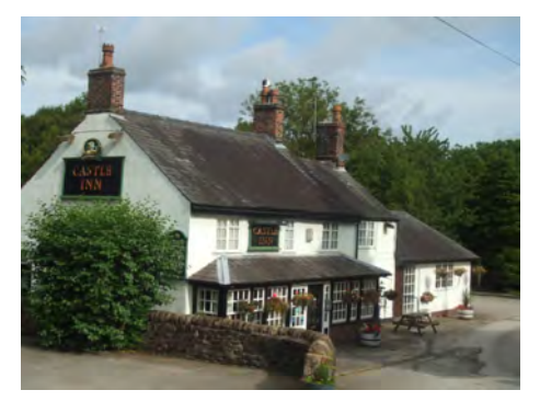
Castle Inn Castle Inn Road CW12 3LP

1858-1860 by Joseph Clarke of London, St Stephens has group value to the more successful listed Vicarage also by Clarke.