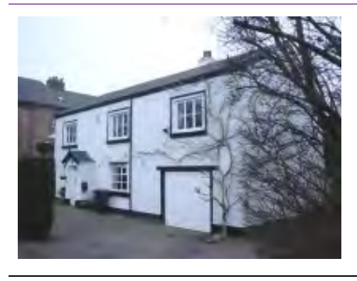
34 Knutsford Road, SK9 6JB

Early 19th century dwelling with many original features, including window casements. Rendered with a slate roof.