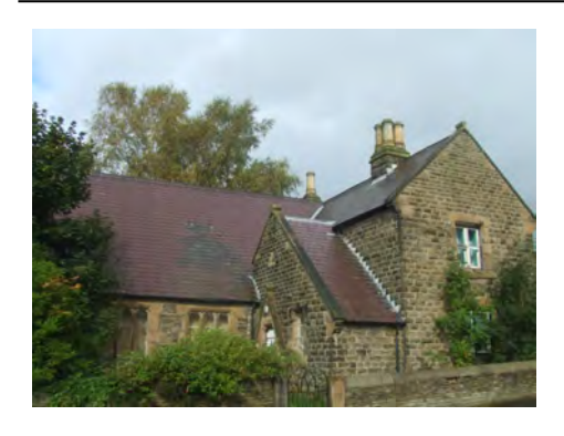
Lother Street School Lowther Street SK10 5QQ

The 23 arch viaduct is a local landmark and a stark reminder of Bollingtons' industrial past.