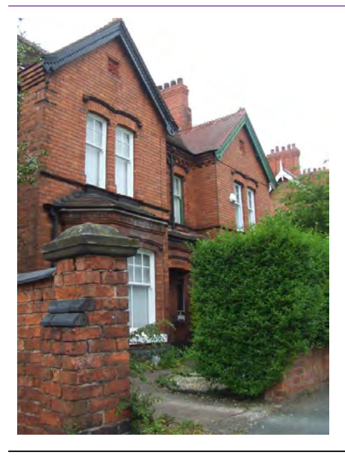
129/131 Wistaston Road

A pair of substantial Victorian semi detached Villas named "Fernhurst" and "The Hawthorns", symmetrical two bay front, interesting brick detailing.