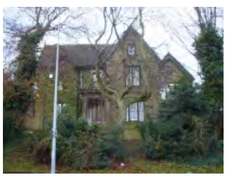
113, London Road SK11 7RL

This is an excellent example of a Victorian semi-detached property. The building consists of brick with a slate roof and features timber sash windows either side of the front door.