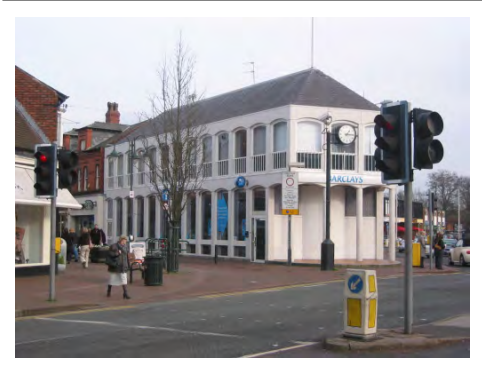
Barclays Bank 59 Grove Street SK9 1ER

Rare example of an Art Deco house in the area, with white rendered walls with parapets and steel framed windows built in the 1930s. Little altered.