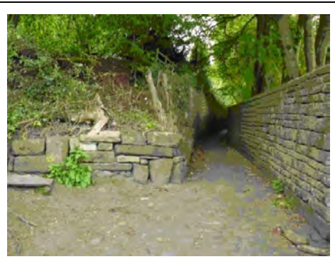
Old Grammer Cockshuts Path

Quintessential country cottage dates circa 1830.