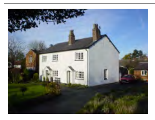
140-142 Knutsford Road SK9 6JP

Pair of late 18th century semi-detached thatched cottages.