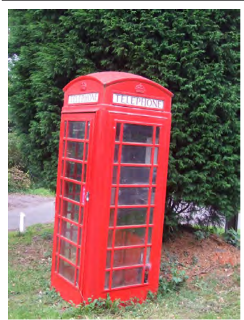
Type K6 Telephone Kiosk Holmshaw Lane

K6 Telephone Kiosks were designed in 1935 to commemorate the Silver Jubilee of King George V. K6 was the first red telephone kiosk to be used extensively outside London. K6 was the most prolific Kiosk in the UK.