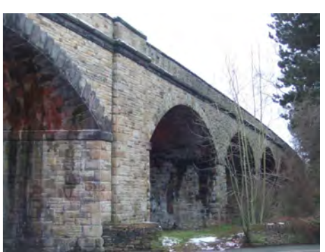
Railway Viaduct Grimshaw Lane SK10 5NJ

Unveiled in 1904 in memory of Samuel Greg who lived at The Mount on Flash Lane and owned Lower House Mill, an important local figure. The Greg Fountain and seat sit at the entrance to Flash Lane.