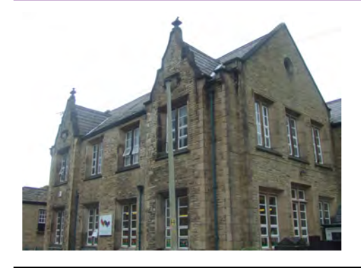
Water Street School Water Street SK10 5PA

A redundant Victorian Wesleyan School now used for community uses. Constructed in 1846 in local sandstone. An imposing building with twin gables facing Water Street.