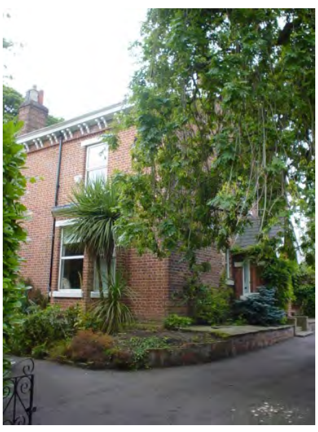
Hawthorn Villa 5 Albert Road SK9 5HT

Rare example of a speculative 1930s house in the International Modern Style. Stuccoed. Original features and steel 'Crittal' windows survive.