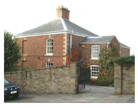
Blakelow House 56 Blakelow Road SK11 7ED

The building itself is brick with smooth rendering with a tile roof and to the front, features a glazed porch.