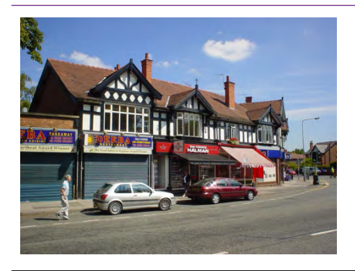
1-13 Fountain Place SK12 1QX

Early 20th century corner composition in a vernacular revival style. Very prominent within the settlement.