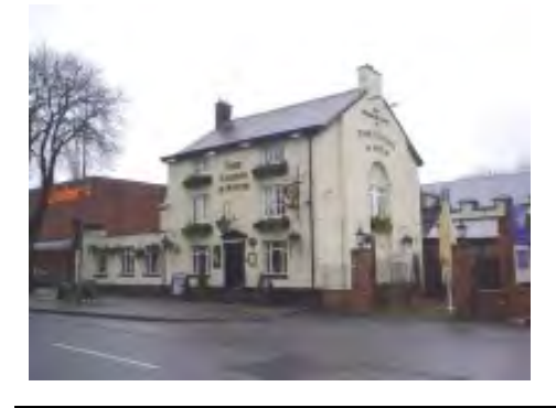
The Coach & Four 69 – 71 Alderley Road SK9 1PA

Public House. May have started as a late-Georgian farmhouse. Altered, but retains much original character, including a pedimented doorcase.