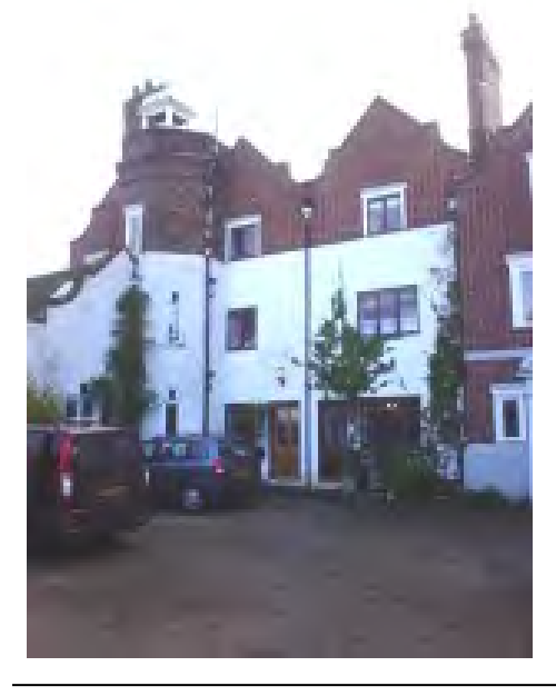
24 & 32, 30, 26 London Road South SK12 1NJ

Victorian mansion, dated 1874, built in 17th century style. Now in use as flats.