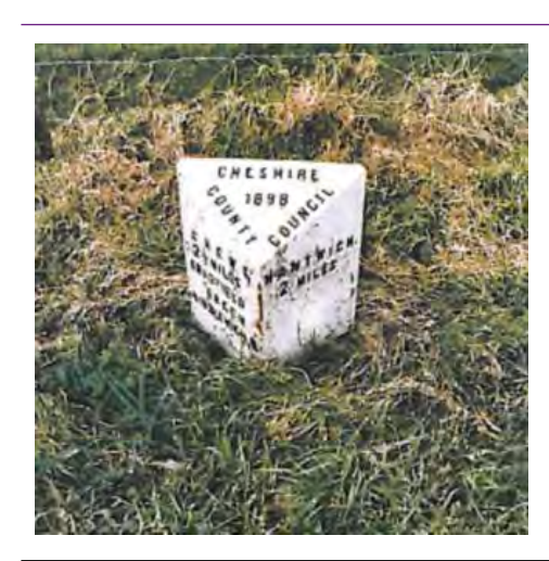
Mile Post Nantwich Road

Three sided cast iron mile post dated 1898. Substantially unaltered example of this architectural and historic type. A distinctive structure.