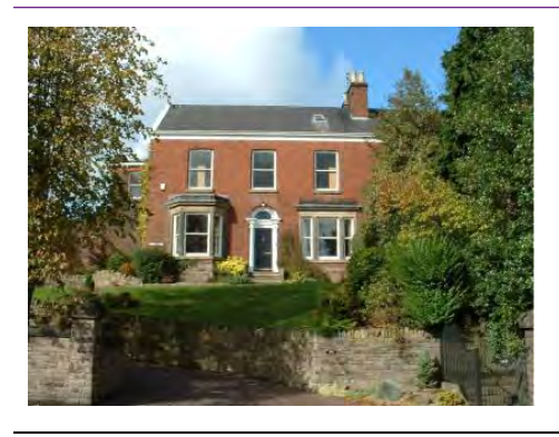
109-111 London Road SK11 7RL

This is an excellent example of a Victorian semi-detached property. The building consists of brick with a slate roof and features timber sash windows either side of the front door.