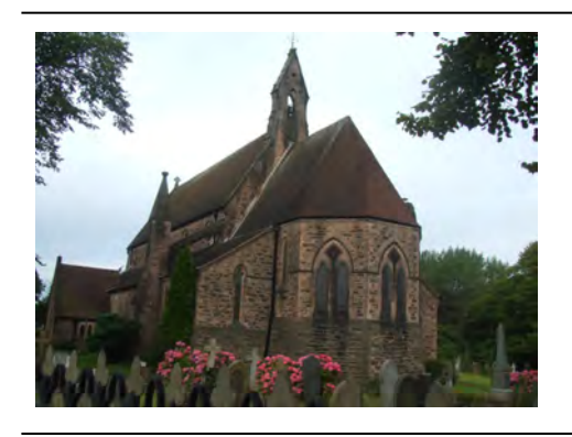
St Stephens (Vicarage listed) Brook Street CW12 1RJ

The buildings reflect local vernacular in this part of Cheshire.