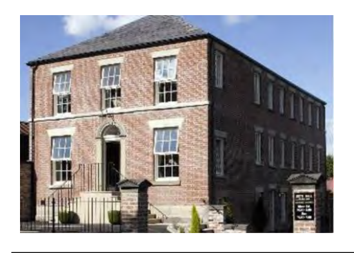
West Heath Mill Bryn Hall (40) Holmes Chapel Road CW12 4NG

1 Duke Street is another example of 1930s architecture with strong horizontal lines formed by decorative brickwork and banding.