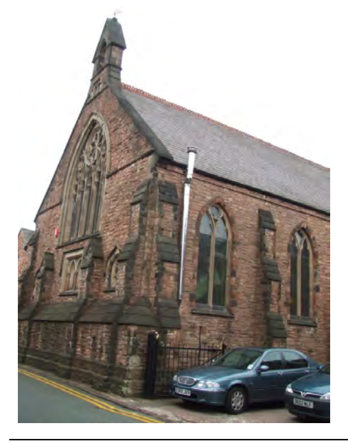
Pentecostal Chapel Cross Street CW12 1HQ

The Pentecostal church hall on Cross Street was built as a chapel for the Unitarians but later taken over. The new Pentecostal Chapel opened in 1883, built of pink sandstone from the Tegnose Quarry near Macclesfield.