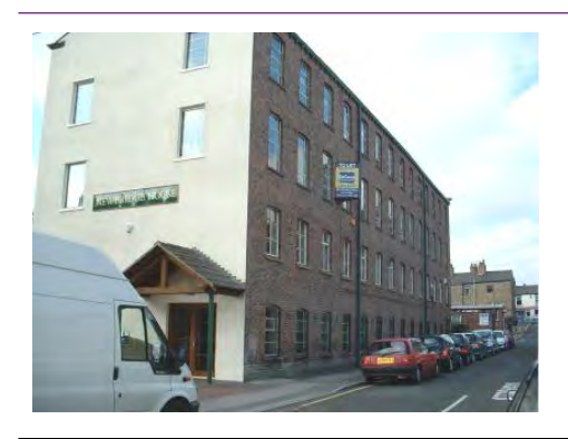
Newbridge House Henderson Street SK11 6RA

Newbridge House is a 4-storey Victorian mill consisting of brick to side elevation with timber windows, and modern smooth render to the entrance gable end.