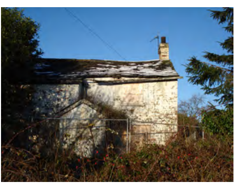
Lower Roewood 70 Birtles Road SK10 3JG

This Italianate-style house is of Victorian date and consists of brick with arched windows and stone window surrounds with keystone, finished with a pitched slate roof. It was originally constructed in a mid-terrace position. The external gable wall is a modern addition, following the demolition of the adjoining house during the construction of the upper section of Hibel Road in the early 1980s.