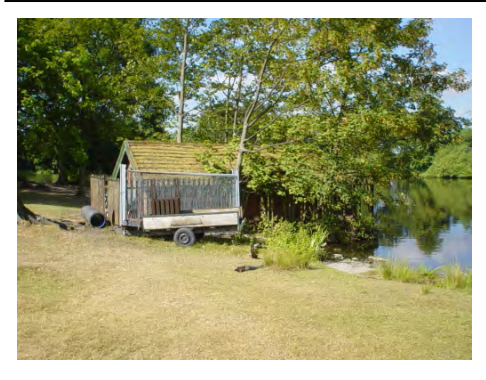
Poynton Park Boathouse London Road North

Early 20th century corner composition in a vernacular revival style. Very prominent within the settlement.