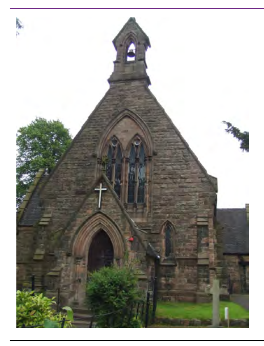
Holy Trinity Church Biddulph Road CW12 3LZ