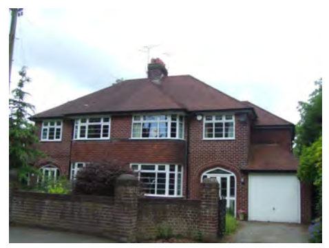
149-155 Wistaston Road

A pair of substantial Victorian semi detached Villas named "Fernhurst" and "The Hawthorns", symmetrical two bay front, interesting brick detailing.