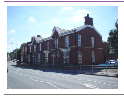
8-14 Beech Lane SK10 2DR