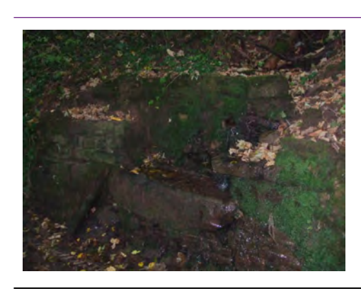
Stone Trough Red Lane SK12 2NP

This trough appears on a map of 1871; thought to be mid/late 19th century origins.