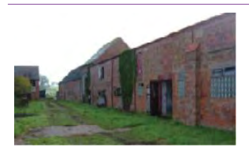
Ridley Hall Barns Wrexham Road Ridley CW6 9SA