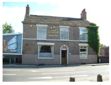
The Albion Hotel 6 London Road SK11 7QX

St. Edward's Church was constructed in the 1950s and consists of brick with stone details and carvings finished with a slate roof.