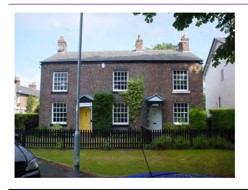
4 & 6 Gravel Lane SK9 6LA

A fine pair of semi-detached early Victorian brick cottages with a Welsh slate roof. Top-hung sliding sash windows with eight-over-eight glazing pattern. Brick arches over window openings.