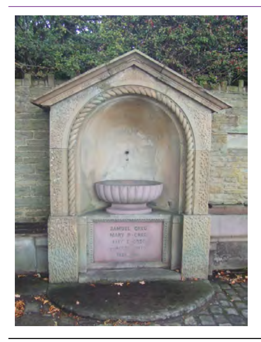
Greg's Fountain Flash Lane SK10 5AQ

Unveiled in 1904 in memory of Samuel Greg who lived at The Mount on Flash Lane and owned Lower House Mill, an important local figure. The Greg Fountain and seat sit at the entrance to Flash Lane.