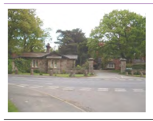
Gateposts Woodlands Crescent

Gateposts to High Legh Hall, 1833-34, designed to match the front lodge.