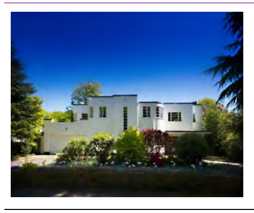
46 Carrwood Road SK9 5DN

Rare example of a speculative 1930s house in the International Modern Style. Stuccoed. Original features and steel 'Crittal' windows survive.