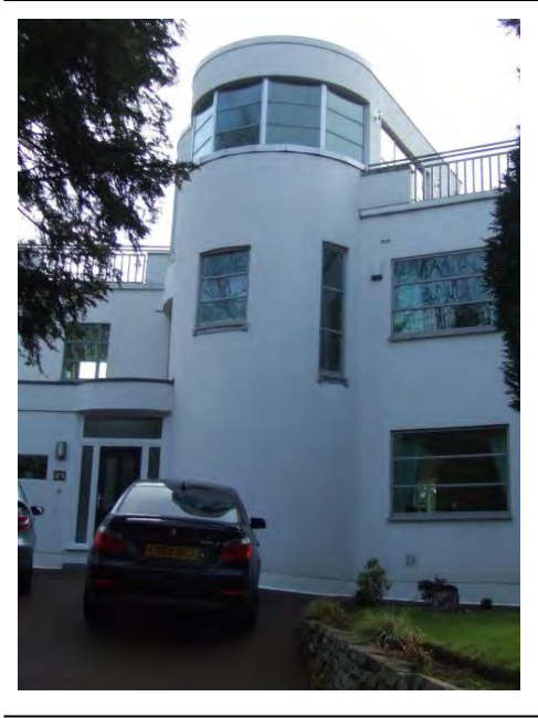
21 Woodlands Road SK9 3AT

A fine pair of semi-detached early Victorian brick cottages with a Welsh slate roof. Top-hung sliding sash windows with eight-over-eight glazing pattern. Brick arches over window openings.