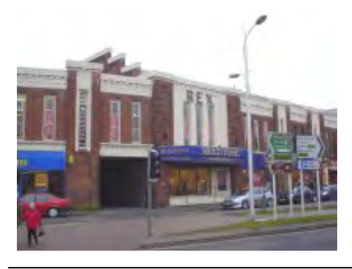
Former Rex Cinema buildings Alderley Road SK9 1HY

1930s cinema and row of shops. Distinctive element in the streetscene.