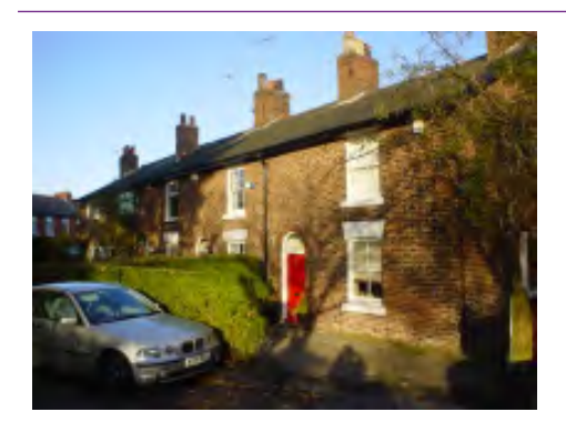
28-36 Church Road SK9 3LT

Attractive terrace of modest brick cottages, of the early-mid 19th Century. Little altered.