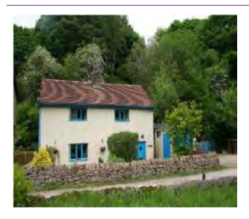
Bracken Cottage Castle Inn Road CW12 3LP

Quintessential country cottage dates circa 1830.