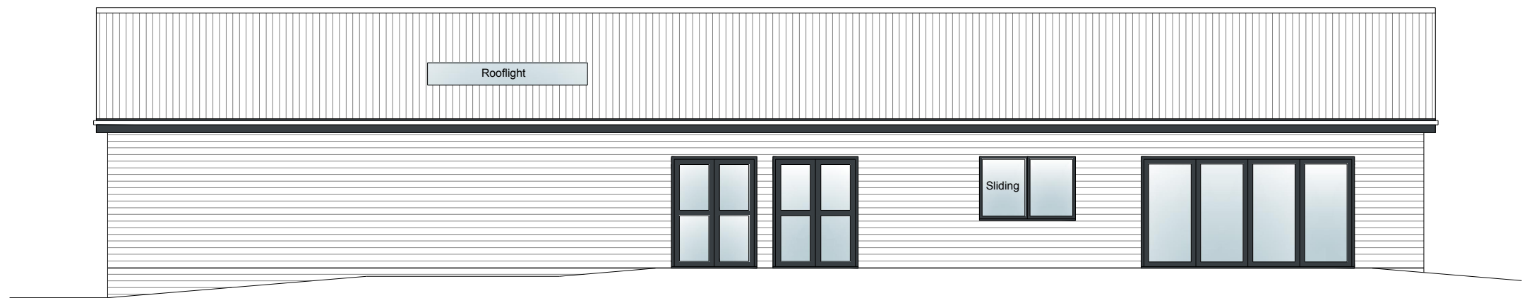
Proposed Northeast Elevation 1:100