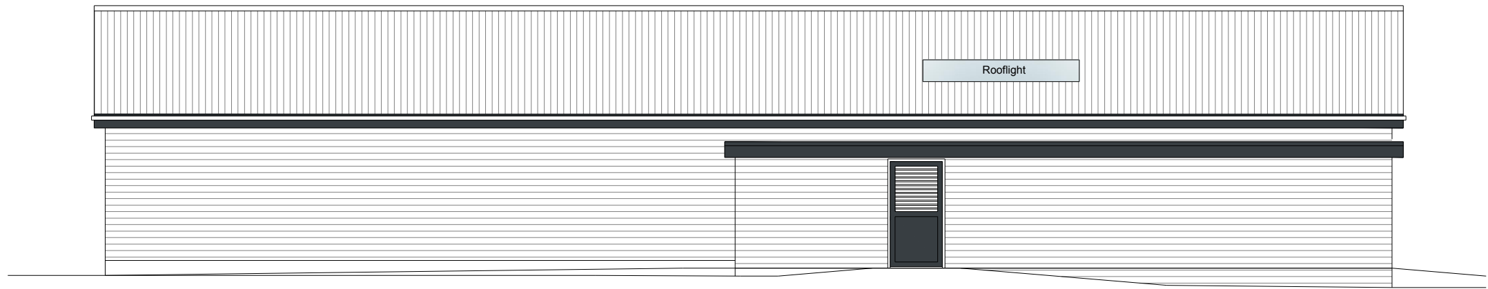
Proposed Southwest Elevation 1:100