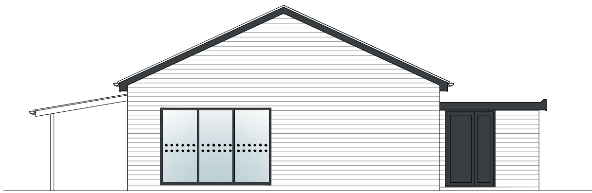
Proposed Northwest Elevation 1:100