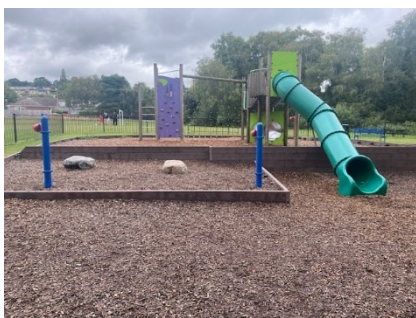
10 – Junior Multiplay