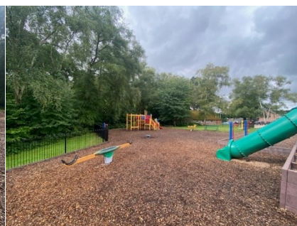
12 – view from swings