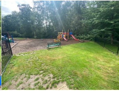
2 – Infant area