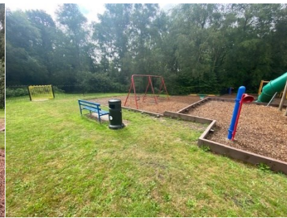
9 – Swings