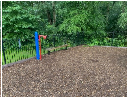
5 – Speaker tube