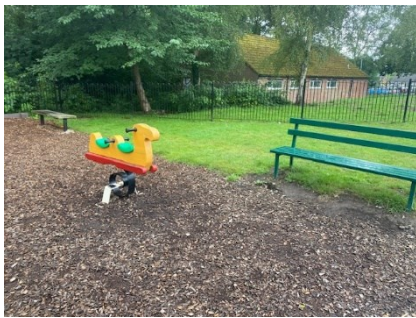
7 – Camel