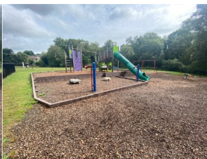
11 – Boulders