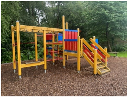
4 – Infant Multiplay