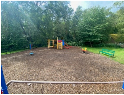
1 – Infant area