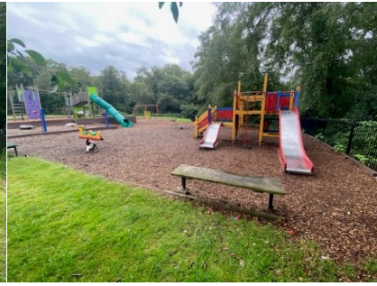
3 – Infant area