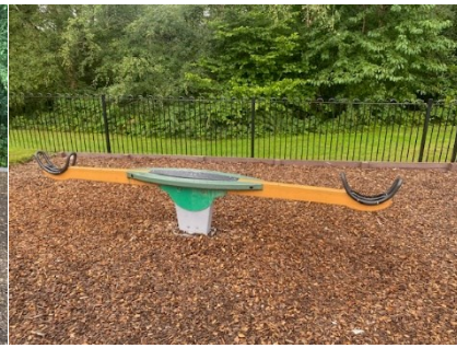
6 – See saw