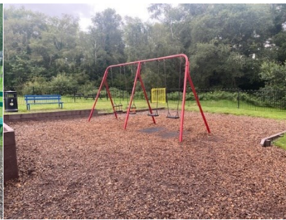
8 – Swings