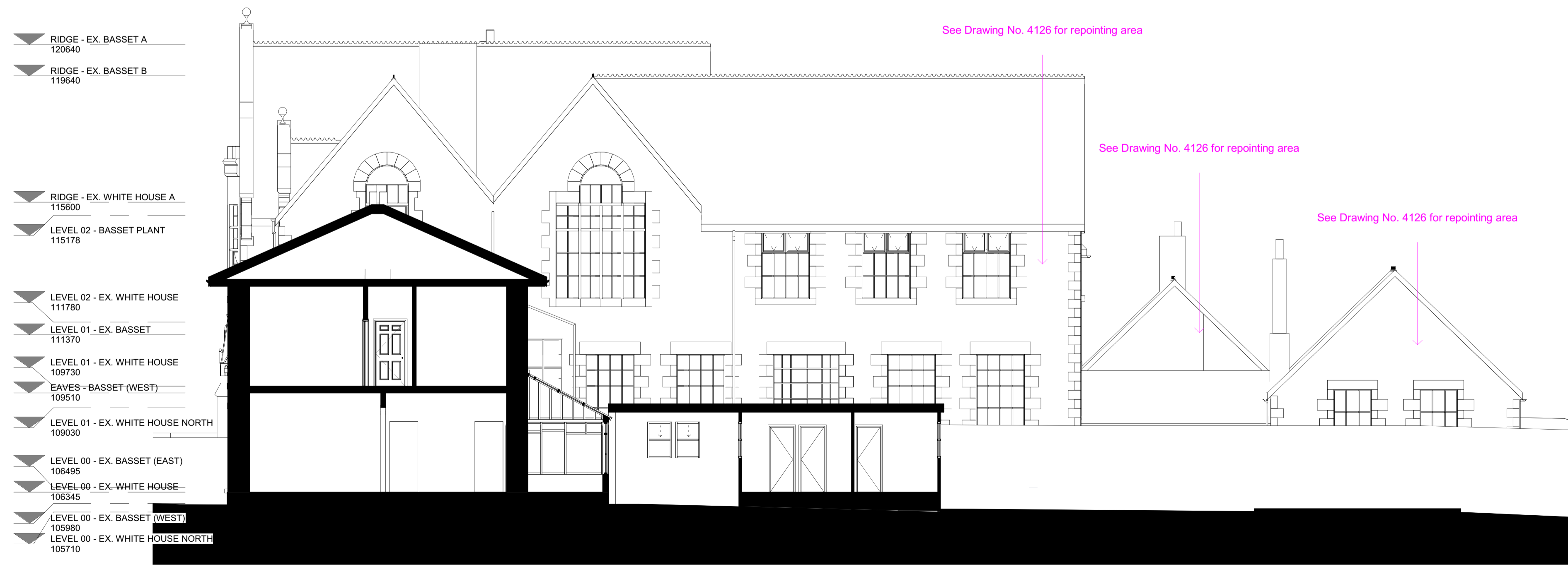
2 SECTIONAL ELEVATION - GA - EXISTING - JJ - NORTH - GRANITE FACADE REPAIR & REPOINTING 1 : 100