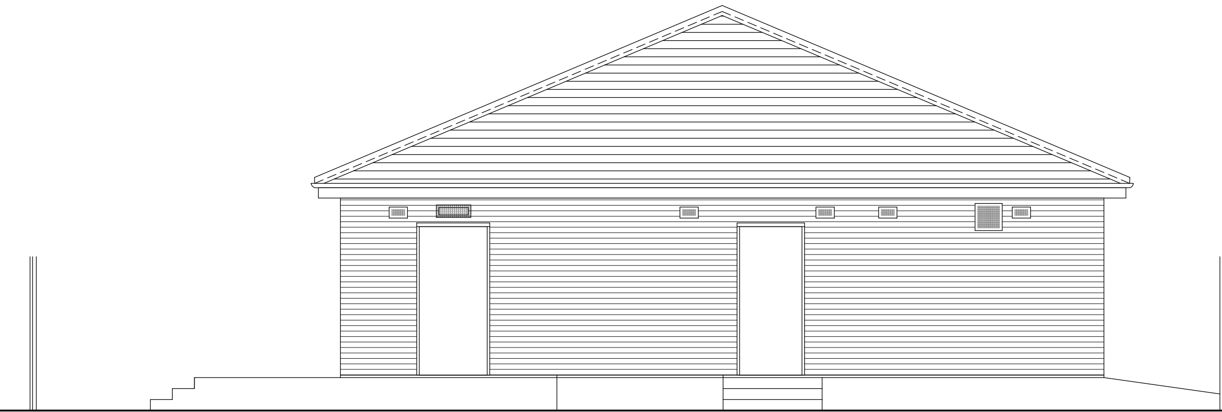
South Elevation - As Existing 1:50