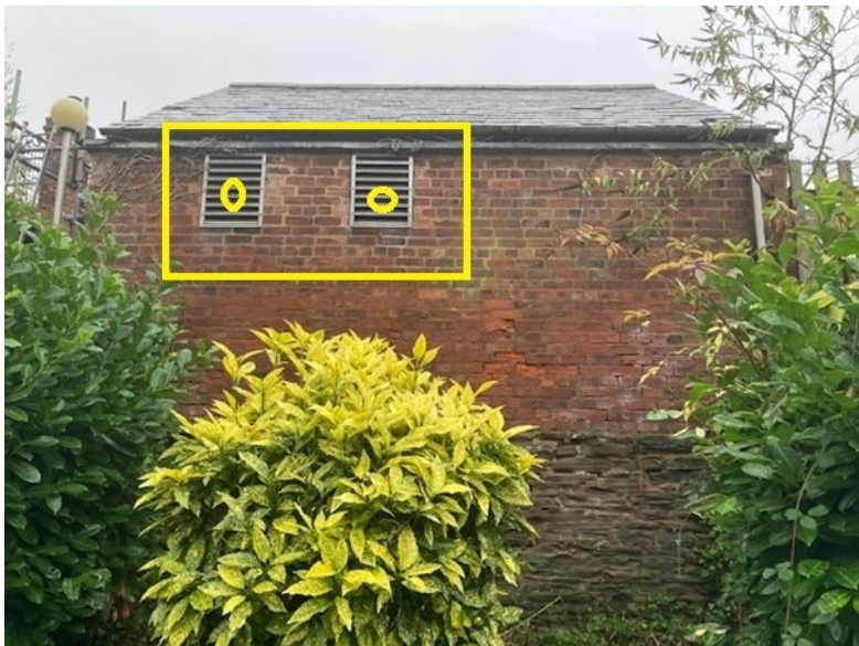
Figure 1: Annotated external photographs showing the location of the final positions for replacement flues and ducts