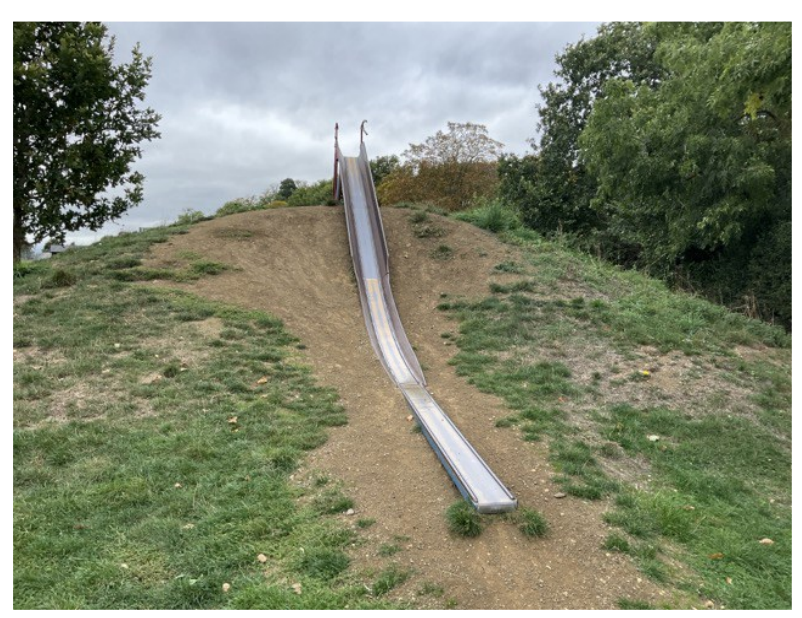
Scope of Work

The Employer considers it is highly unlikely that any economic solution for the slide will contemplate removal of the earth mound as disposal will have to be off site. If the earth mound is not retained in the proposed design of the slide then the tender must include all necessary costs to remove and dispose of this material off site.