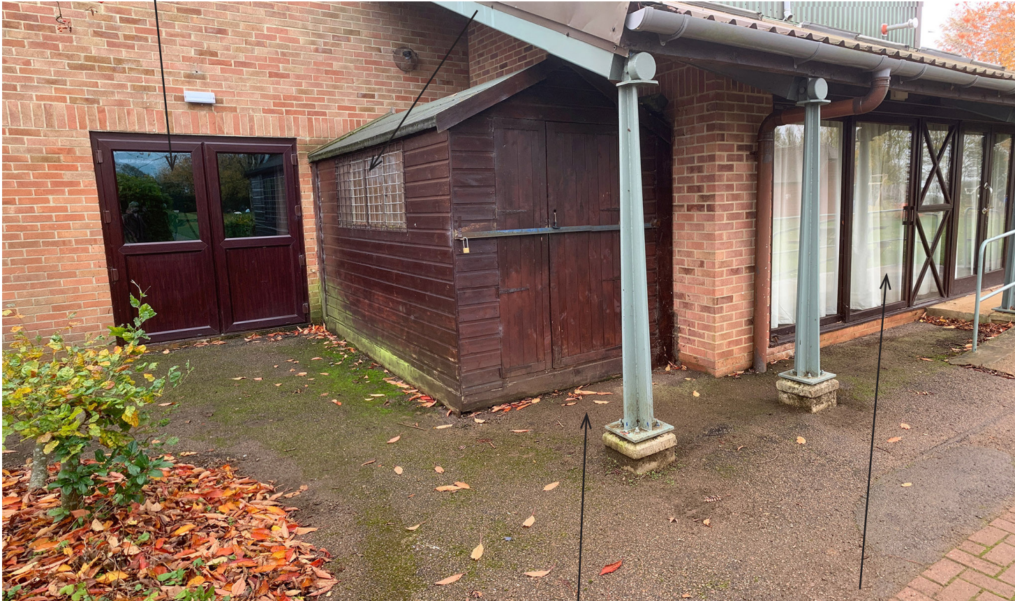
Wheelchair access entrance on w. side, facing playing field