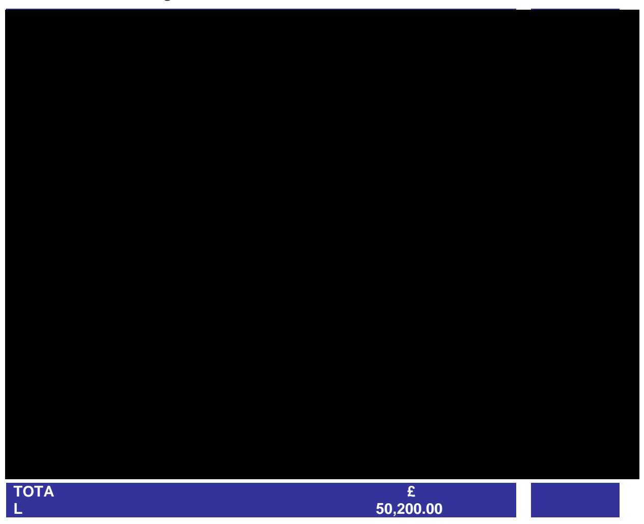
Annex 4 – Supplier Tender