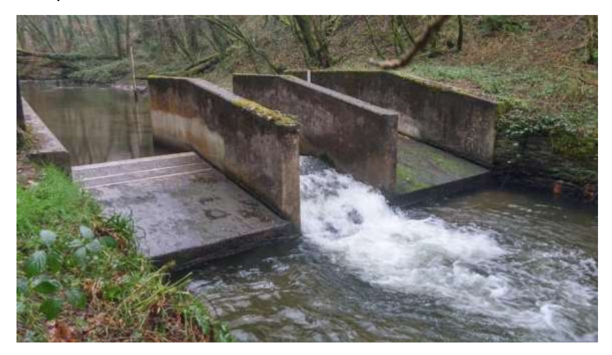
Photo 1: View upstream from right hand bank of Craigshill Wood gauging station in low flows.