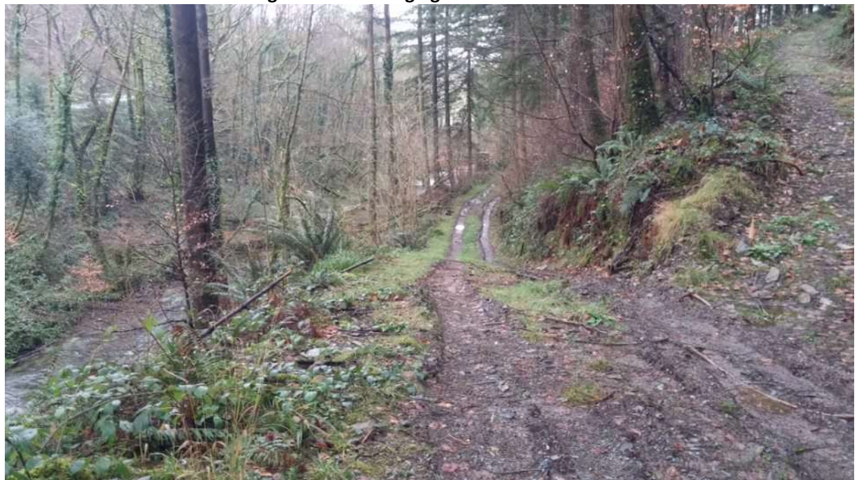
Picture 11: Start of forestry track (beyond gate) which leads directly to Craigshill Wood gauging station.