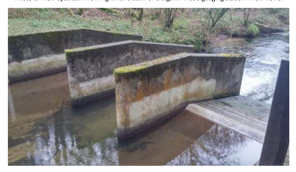
Photo 2: View downstream from right hand bank of Craigshill Wood gauging station in low flows.