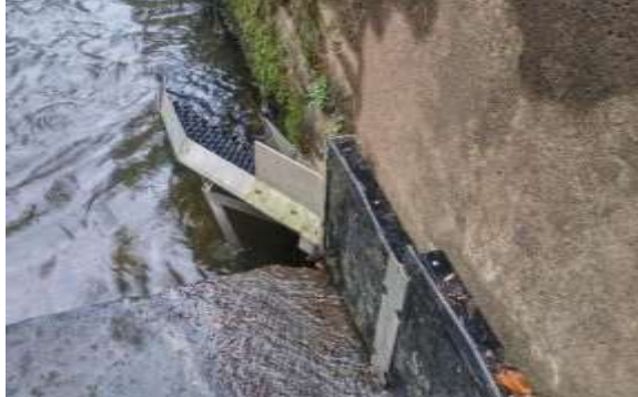
Picture 7a and 7b: Eel cassette pass attached to right hand side wingwall of Craigshill Wood gauging station.