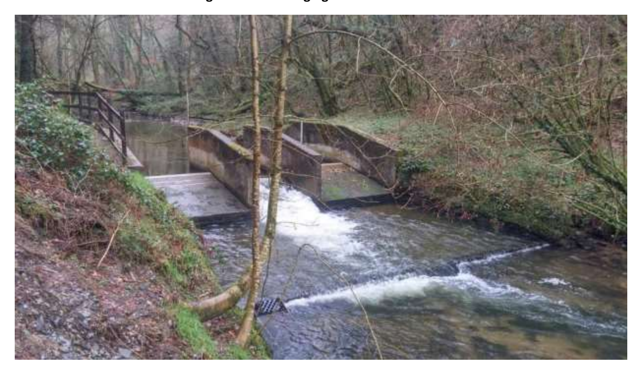
Photo 3: View of structure and downstream pre barrage and eel pass in low flows.