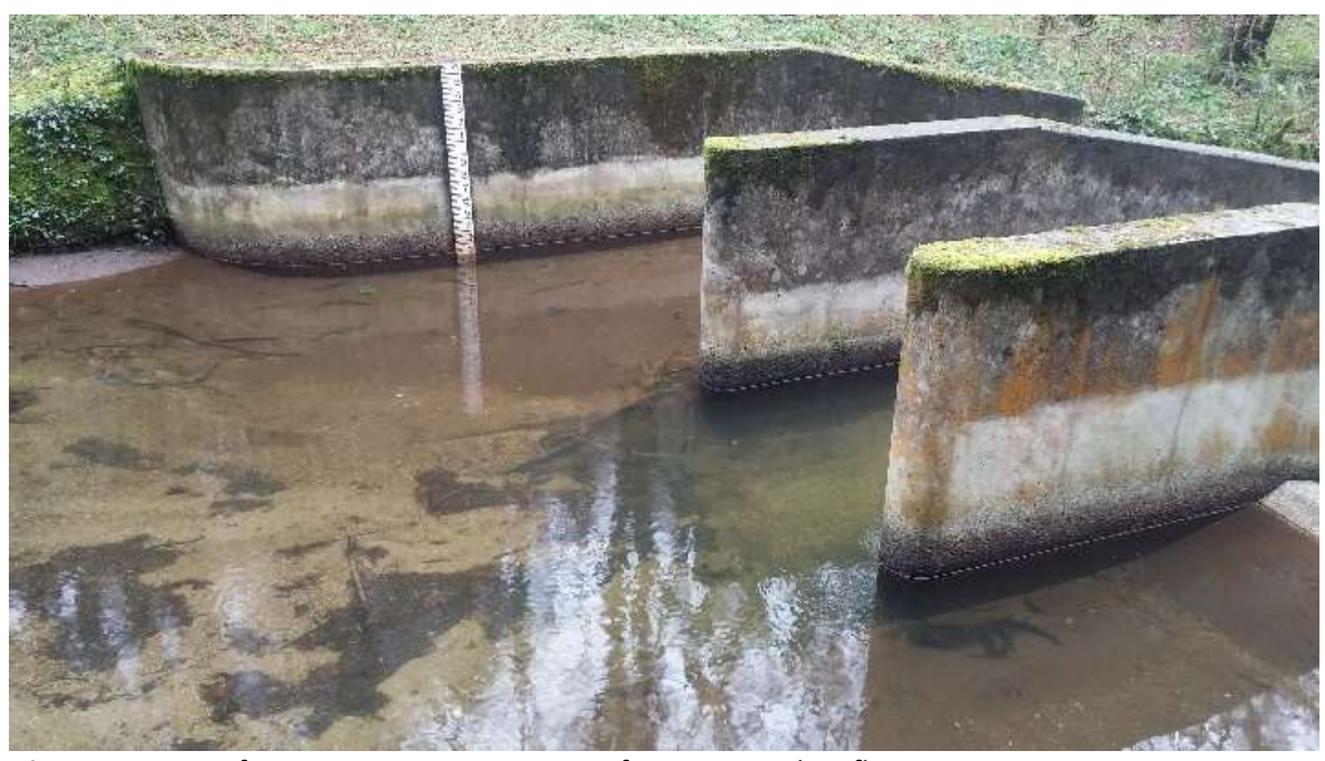
Picture 6: View of gauging section upstream of structure in low flows.