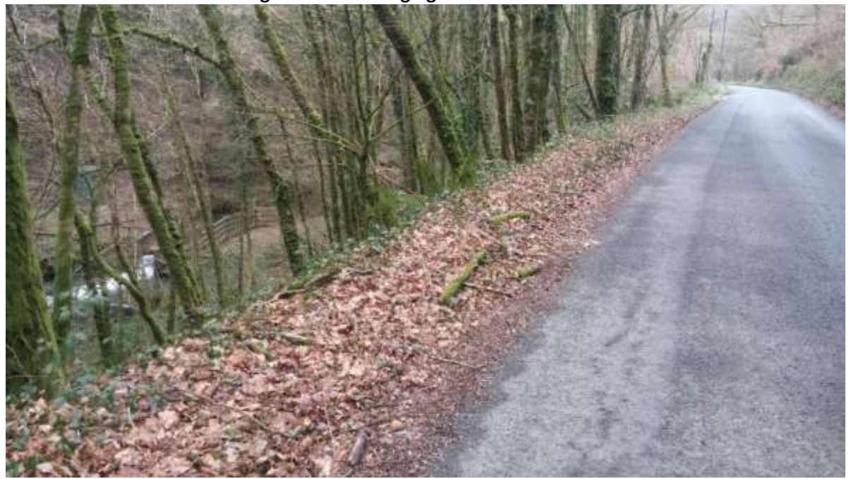
Picture 9: Road adjacent to structure on left hand bank which leads to forestry access gate.