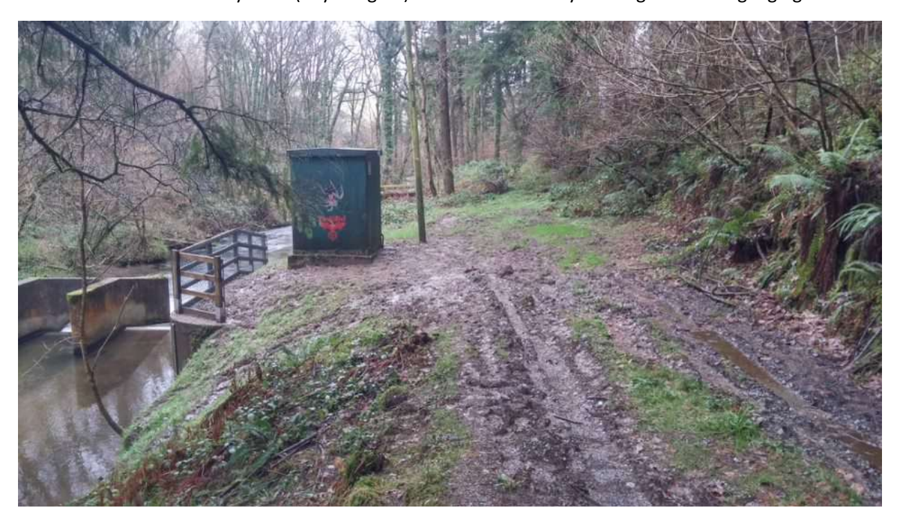
Picture 12: End of forestry track which leads to gauging hut and lay down area.