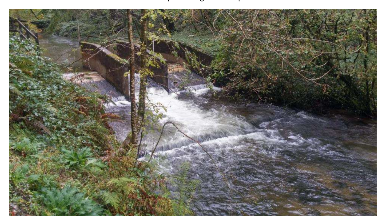
Photo 4: View of structure and downstream pre barrage and eel pass in elevated flows.