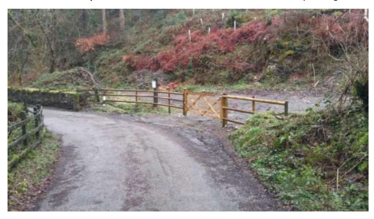
Picture 10: Gate part way down the road which leads to a forestry track and grants access to the work site.