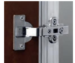
MFC and HPL hinge in pressed steel