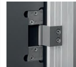
SGL hinge in industrial nylon and optional locks extruded aluminium