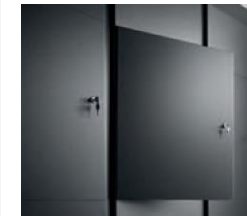
Hinged and lockable access panels

The option of locks is ideal for areas where security is paramount.