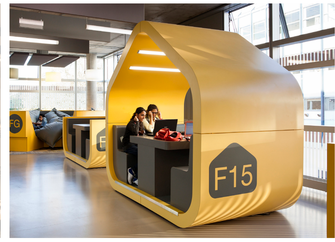
These precedents are for illustrative purposes to capture the project aspirations for spaces and are subject to evaluation for affordability by the project team.

Hawkins\Brown © | 22.09.17 | 17034_170908_Stage1Report | RIBA Stage 1 Report