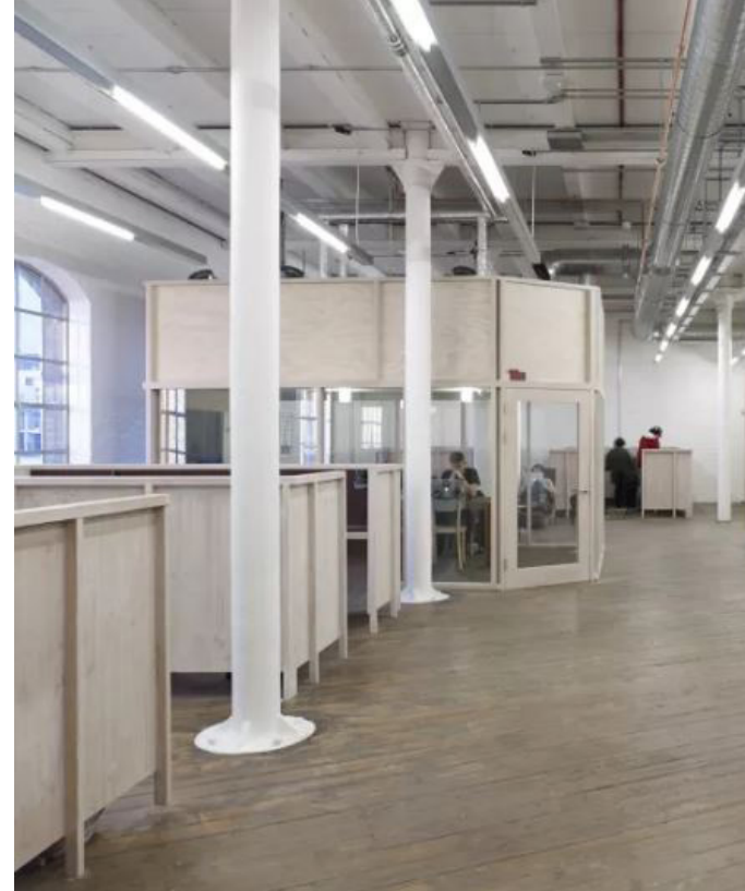
These precedents are for illustrative purposes to capture the project aspirations for spaces and are subject to evaluation for affordability by the project team.

Hawkins\Brown © | 22.09.17 | 17034_170908_Stage1Report | RIBA Stage 1 Report