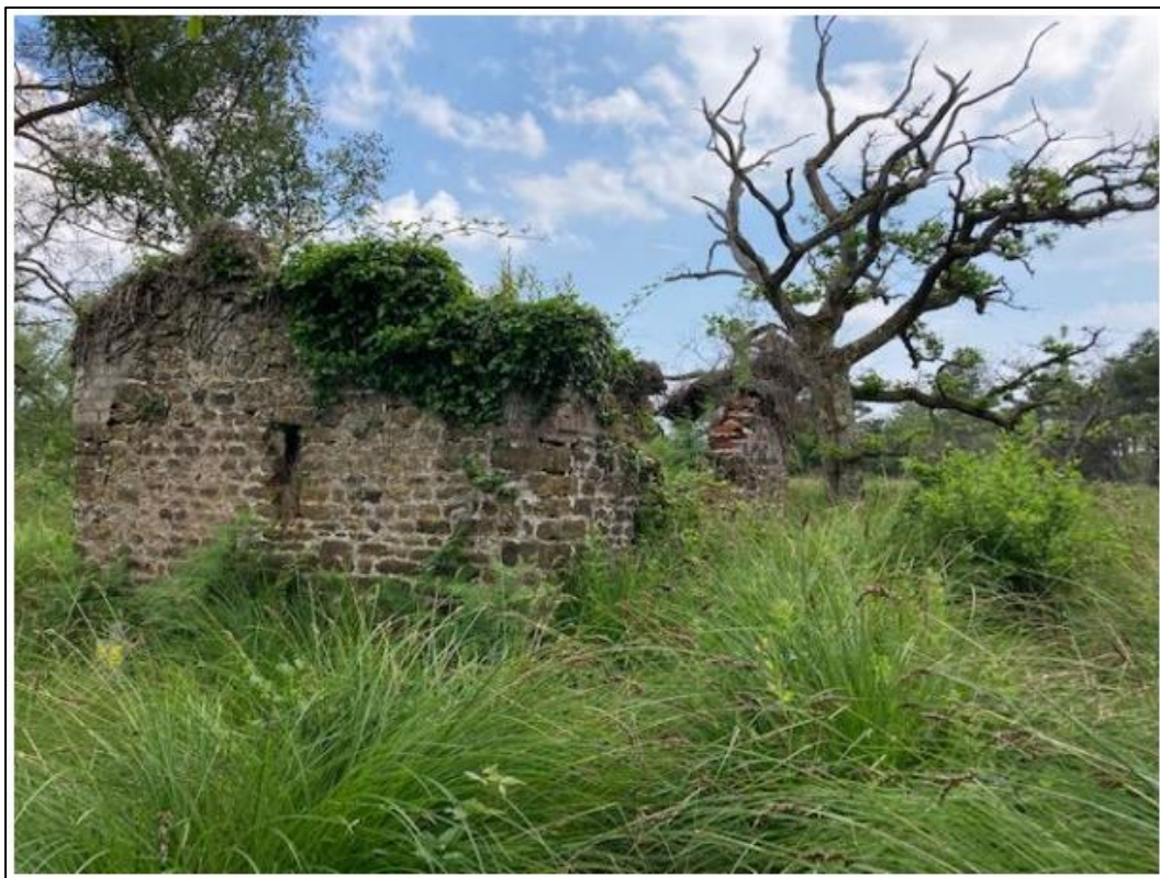
Figure 3: The overnight shelter at Morden Decoy, Morden Bog NNR (photo- S. Hall).

Decoy pond and associated overnight shelter on Decoy Heath, Wareham St. Martin - Dorset (UA) | Historic England