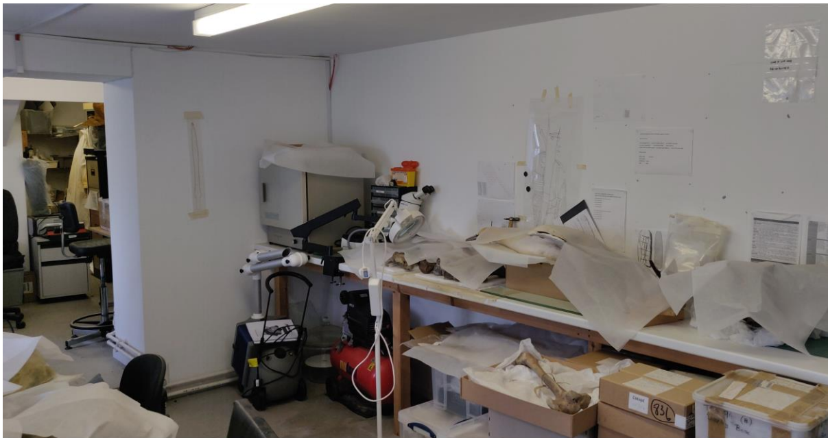
Conservation Laboratory viewed from entrance doorway.