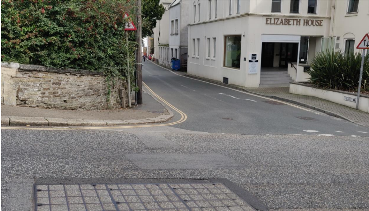
Looking east from Castle Street into The Leats towards the museum. The spiral staircase is by the blue waste bin. This is the route of the new National Grid supply.