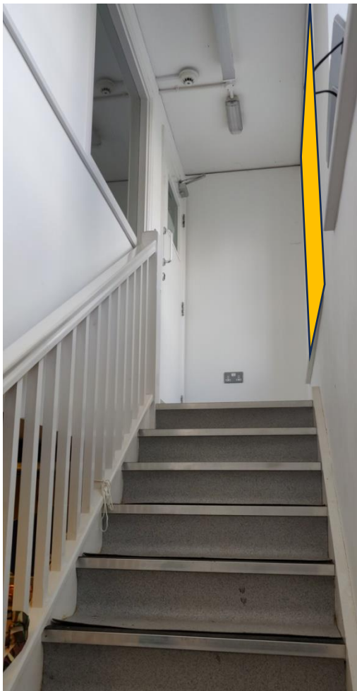
Stairs up to Conservation Laboratory. Note the window coloured dark yellow from the photo above.