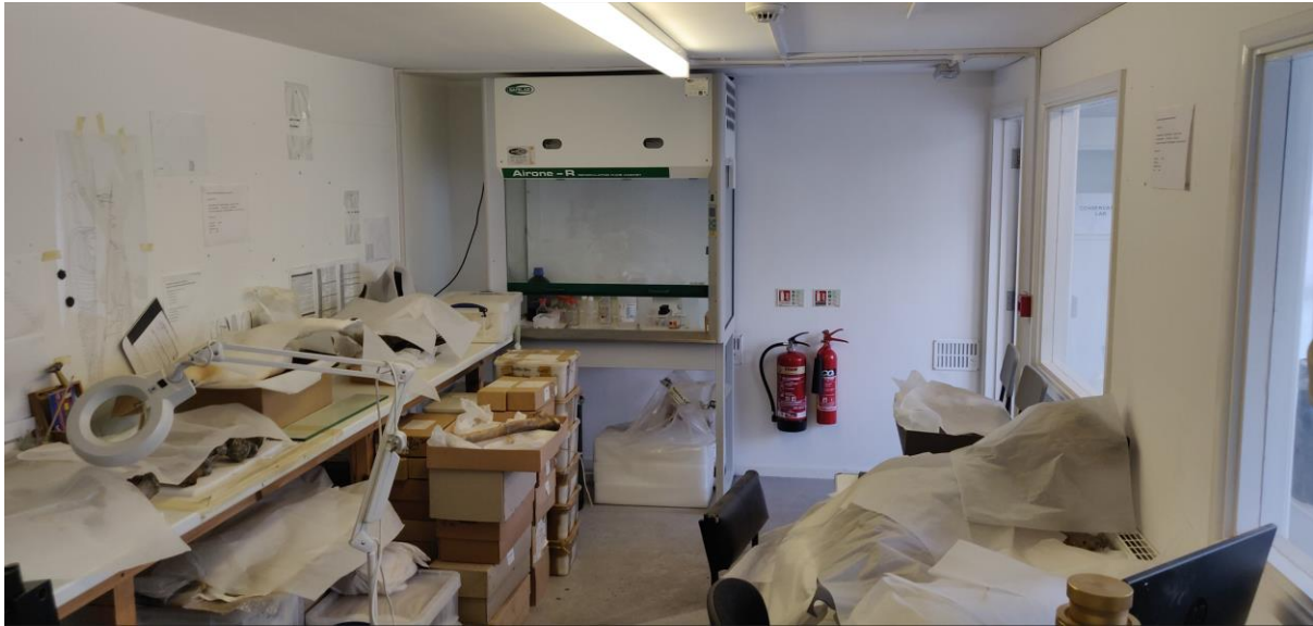
Conservation Laboratory viewed from inside towards the entrance from the internal stairs. The incoming supply will enter on the end wall. Other switchgear will be mounted on the left wall (as viewed). This room will be cleared before works commence.