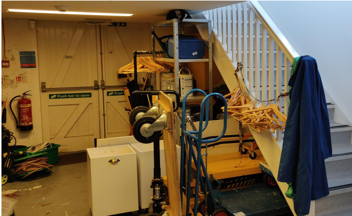
Double doors lead to the spiral staircase. The internal stair leads up to the Conservation Laboratory where the new incoming supply will terminate.