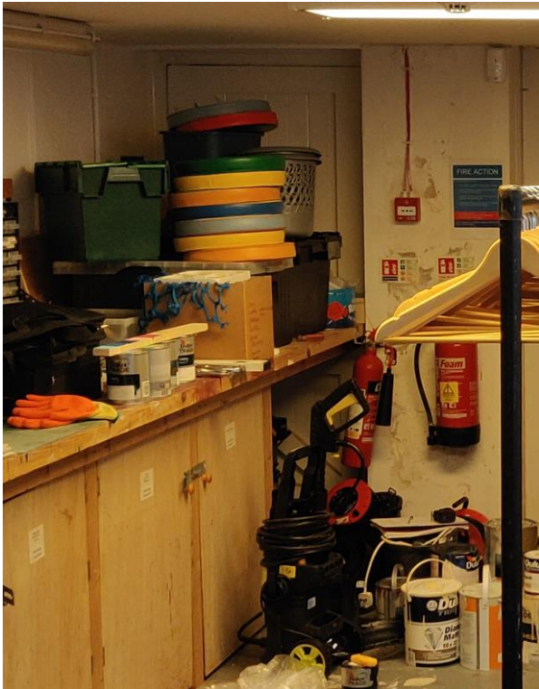
Further photo of door to be blocked up.