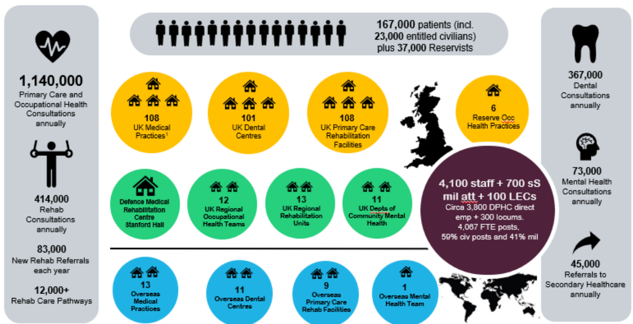
Figure 1. DPHC size and scale

12. DPHC currently employs c. 4,100 staff and additionally 700 single service staff and 100 locally employed civilians. The scale of DPHC can be seen below in Figure 1. DPHC size and scale . Locally employed civilians will be out of scope for this RFI.