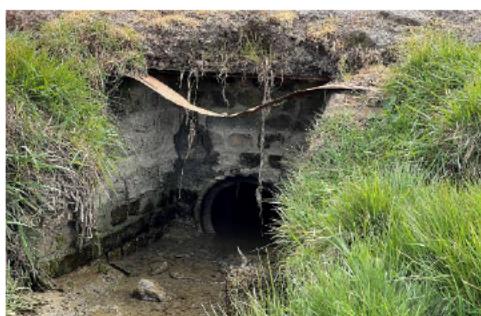
Figure 1. Horseshoe outfall Inlet

The inlet structure is also degraded with pointing loss and cracking of masonry, a failing steel sheet cover and build-up of silt. An access track runs along the back of the embankment above the inlet structure and there is a risk that this loading may further deteriorate its condition.