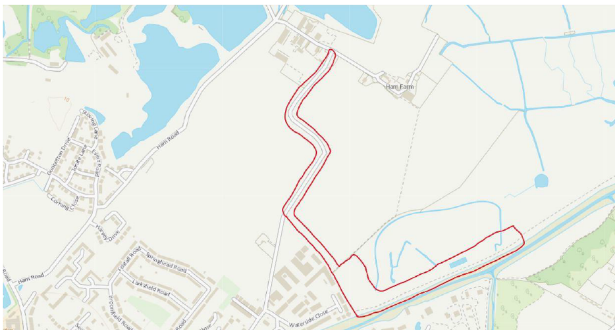
Figure 3: Site boundary

The project is located at: Ham Road, Faversham, Kent ME13 7TS NGR: TR0275062482 - TR0197762043 What 3 words lolipop.frame.shadows