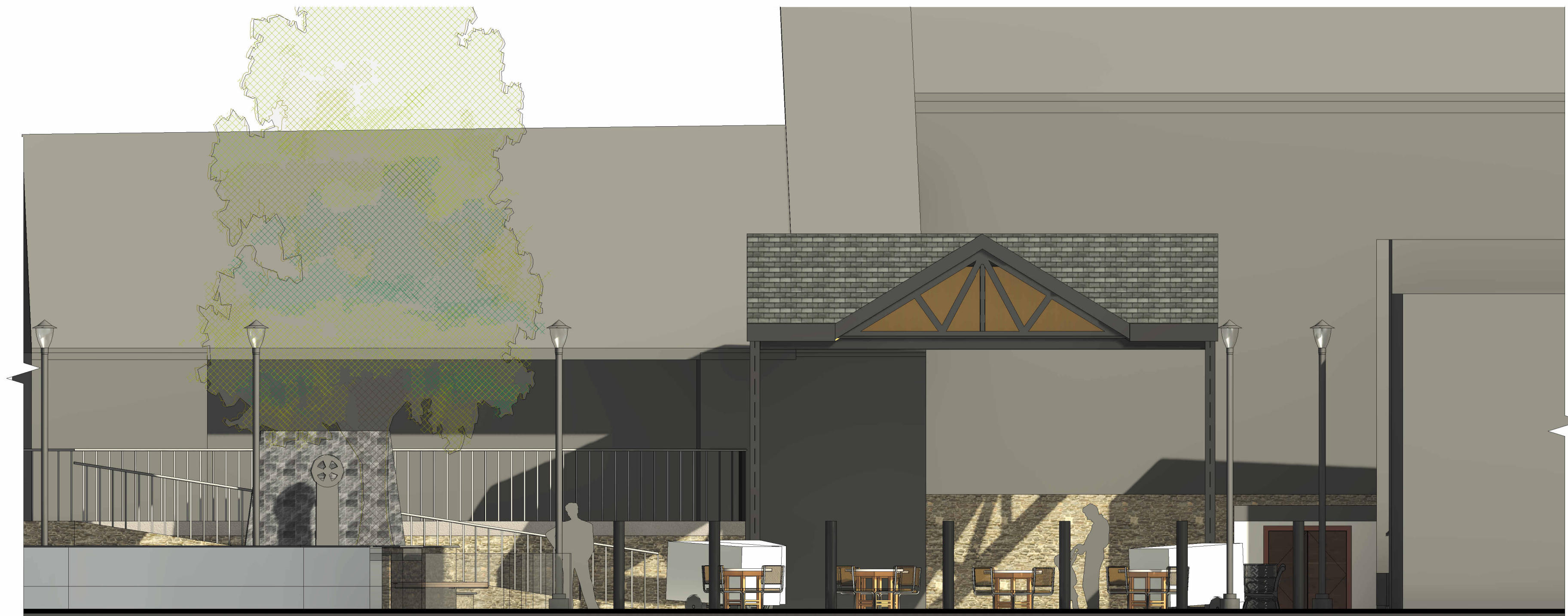
Proposed East Elevation 1:30

Party Wall - Works come under the Party Wall Etc. Act 1996. All appropriate notices and awards should be issued prior to work taking place.