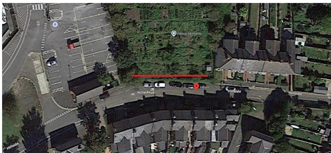
Hillside allotments on The Quay. The hedge is indicated in red and the external side needs cutting which is adjacent to the road. Vehicle parking will require advanced traffic management.