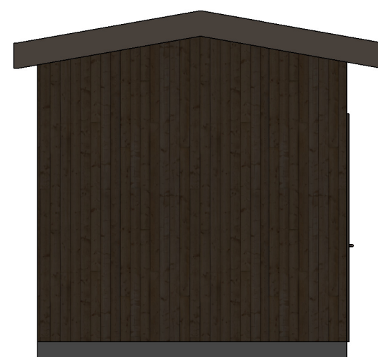
5 West 1 : 50