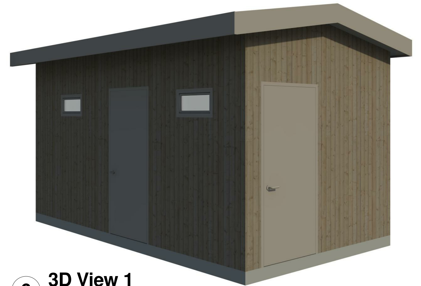
6 3D View 1 1 : 1