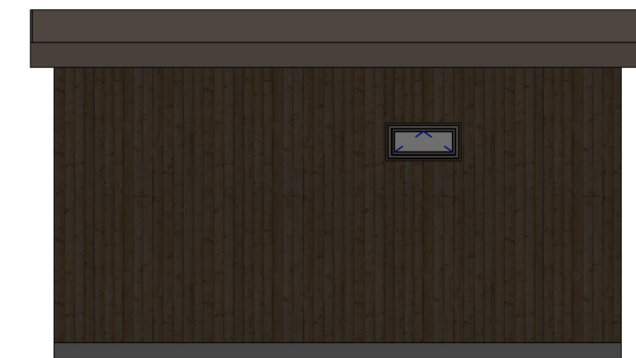
2 North 1 : 50