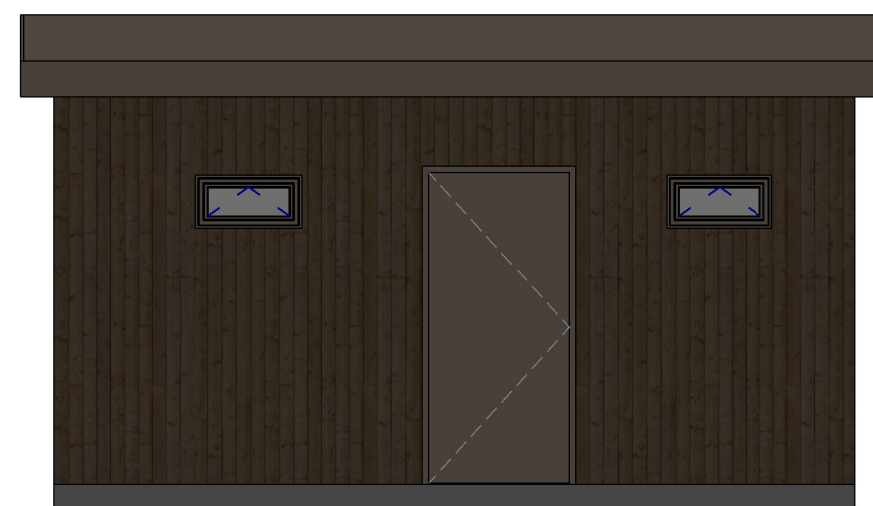
4 South 1 : 50