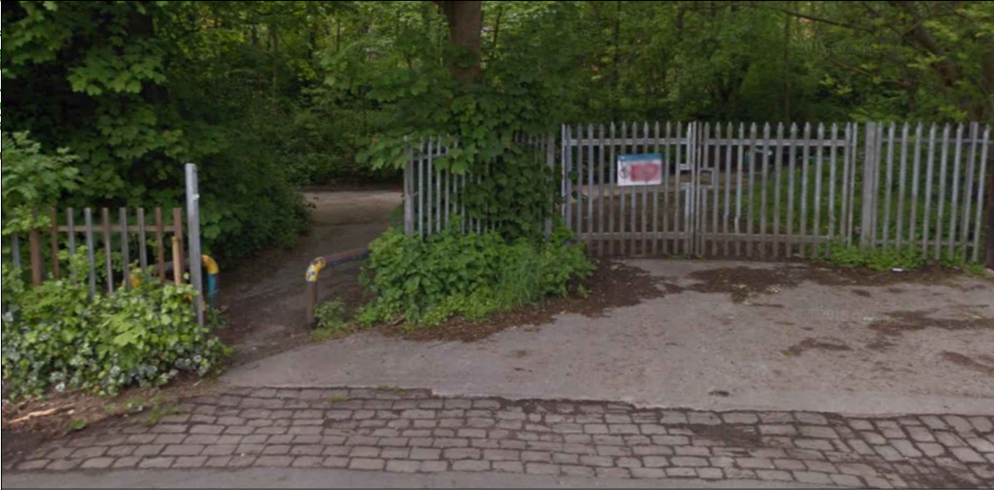
Image 1 View facing south at end of Athol Road showing works access point

Cross section A-A, facing east - approximate profile For surfacing specification refer to standard detail SD/01 Not to scale