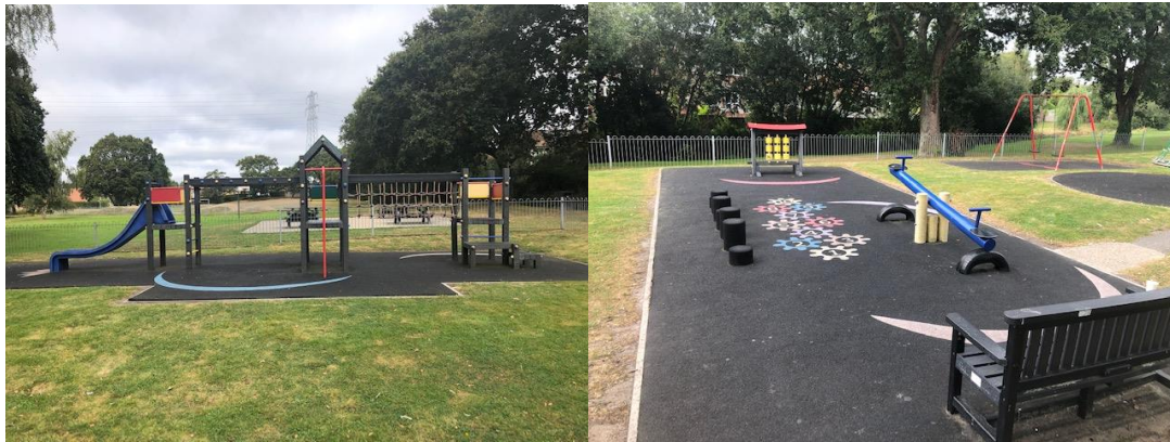
Photos of area, equipment to be replaced in addition to surfacing which should connect to new equipment to ensure a continuous design.

The equipment for the older Junior aged children is preferably to be located towards the main field (North end), and Toddler based equipment to the South.