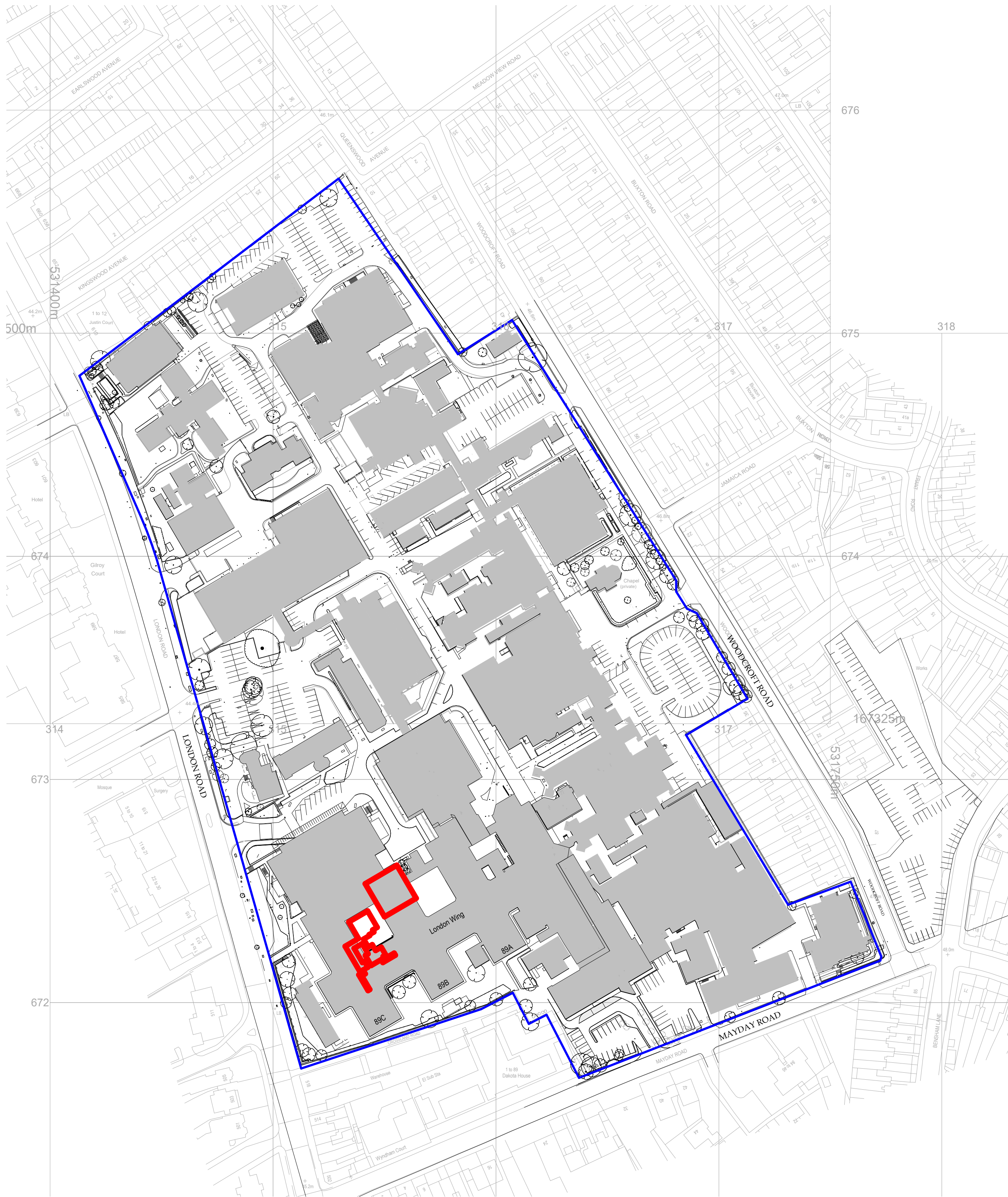
1 LOCATION PLAN. 1:1250