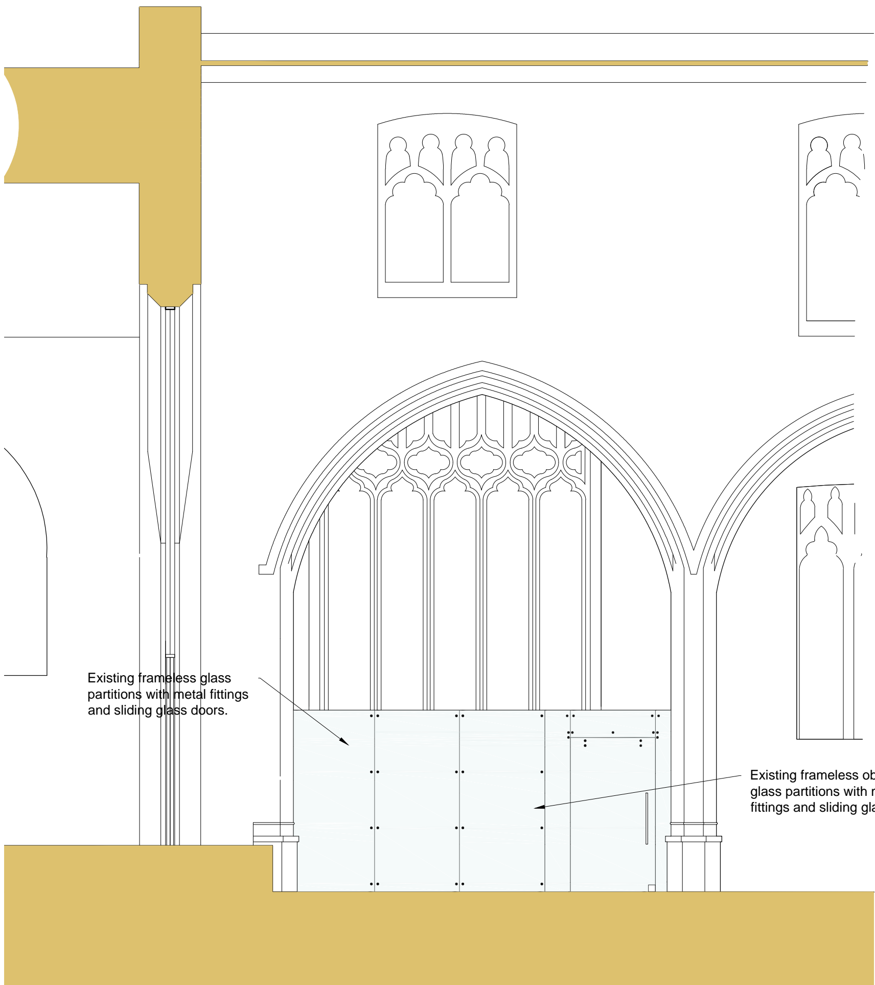
EXISTING PART SOUTH ELEVATION OF INTERNAL OFFICES 1:50