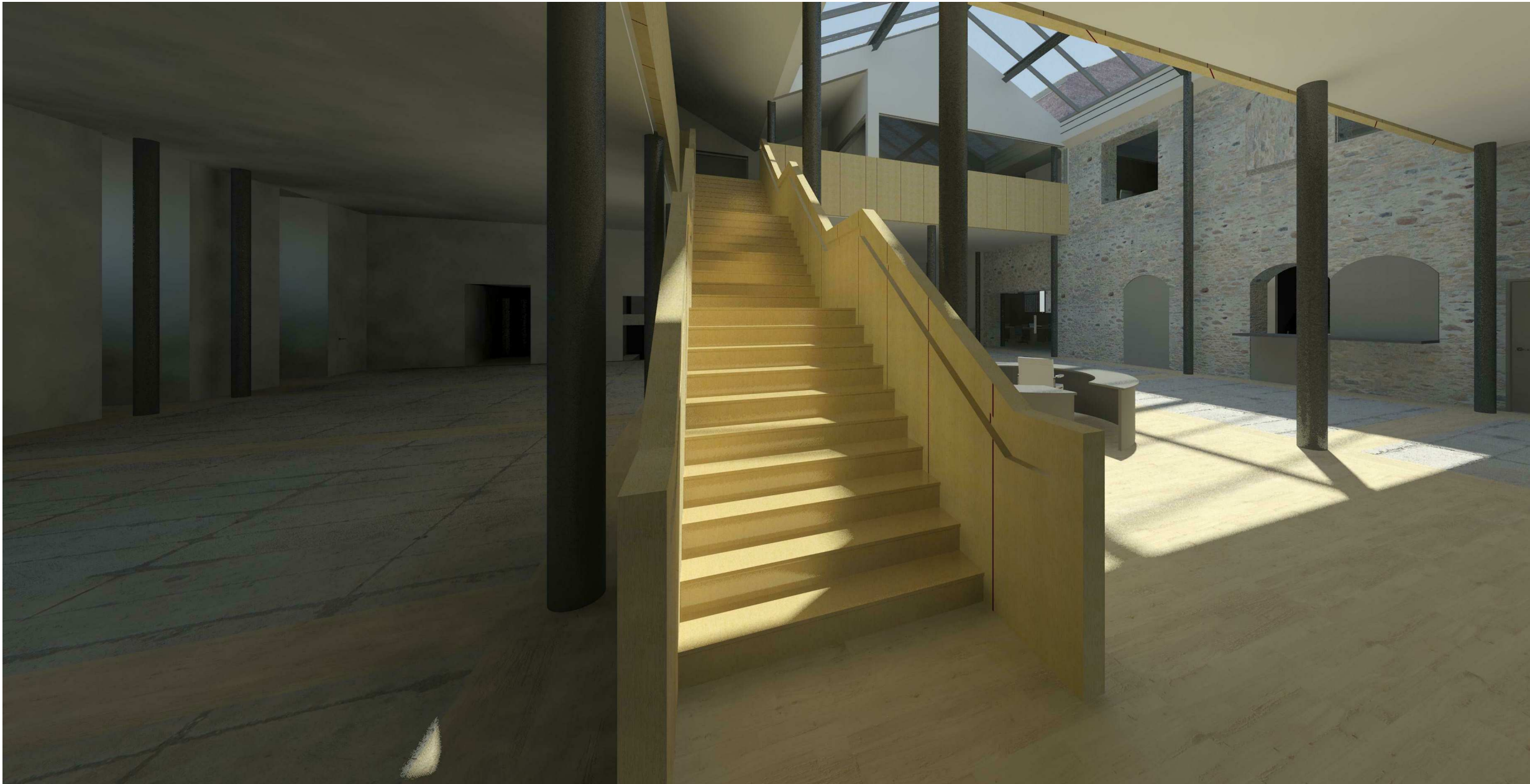
1 962 View from ground floor looking East 1 : 1