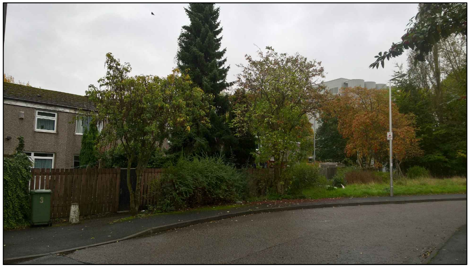
P1 - PHOTO OF AREA A