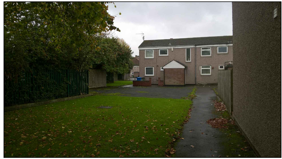
P6 - PHOTO OF AREA E