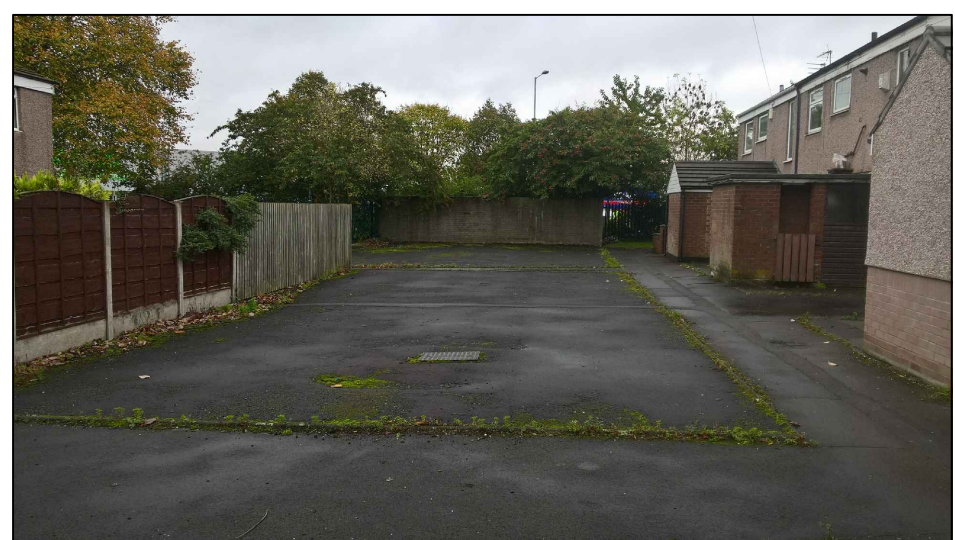
P9 - PHOTO OF AREA H

NOTES DO NOT SCALE THIS DRAWING. ALL DIMENSIONS ARE IN mm UNLESS NOTED OTHERWISE. ALL DIMENSIONS, DETAILS, COMPONENTS AND ASSEMBLIES SHALL BE VERIFIED BY THE CONTRACTOR PRIOR TO CONSTRUCTION, MANUFACTURE OR SUPPLY. ALL MATERIALS, CONSTRUCTION AND DETAILS SHOWN OR IMPLIED BY THIS DRAWING MUST COMPLY WITH CURRENT BRITISH STANDARDS, CODES OF PRACTICE, PLANNING / BUILDING REGULATIONS, H & SE LEGISLATION AND CLIENTS PARTICULAR SPECIFICATIONS. CONFLICTING INFORMATION SHOWN OR IMPLIED SHALL BE REFERRED TO STOCKPORT HOMES. THIS DRAWING AND THE WORKS DEPICTED ARE THE COPYRIGHT OF STOCKPORT HOMES AND MAY NOT BE REPRODUCED WITHOUT WRITTEN PERMISSION. THIS DRAWING MUST BE READ IN CONJUNCTION WITH ALL ENGINEERS, ARCHITECTS AND SPECIALISTS' DRAWINGS AND SPECIFICATIONS.