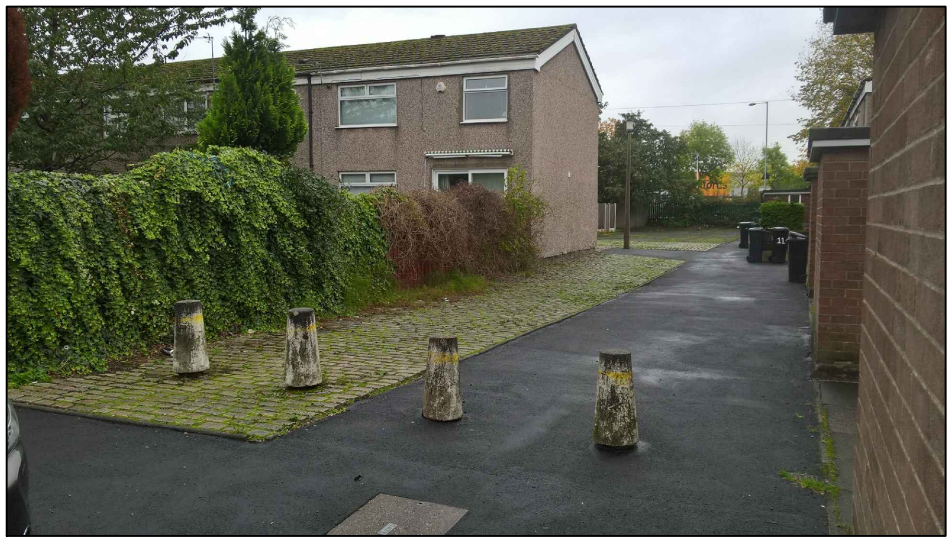
P2 - PHOTO OF AREA B