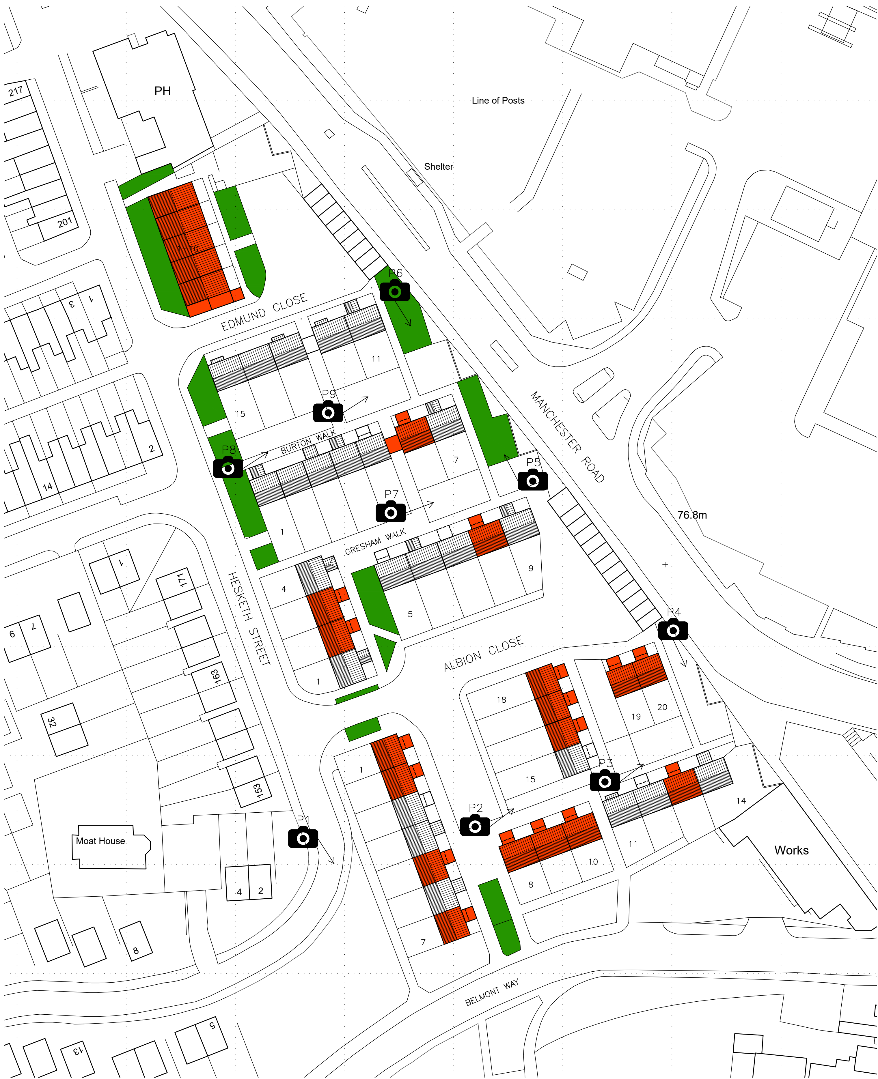
EXISTING PLAN - APPROX. 1:500