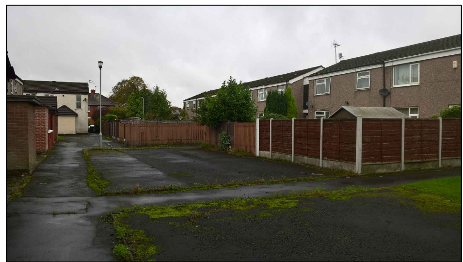
P7 - PHOTO OF AREA F