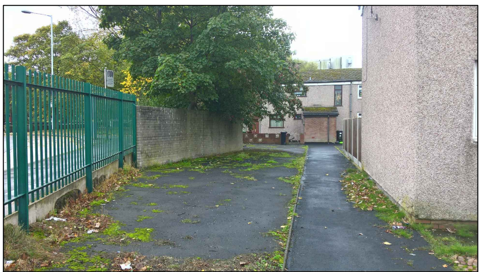
P4 - PHOTO OF AREA D