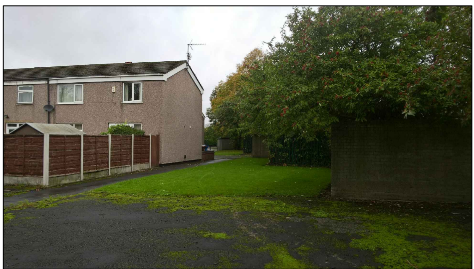
P5 - PHOTO OF AREA E