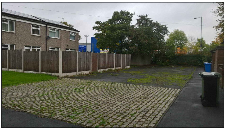
P3 - PHOTO OF AREA C