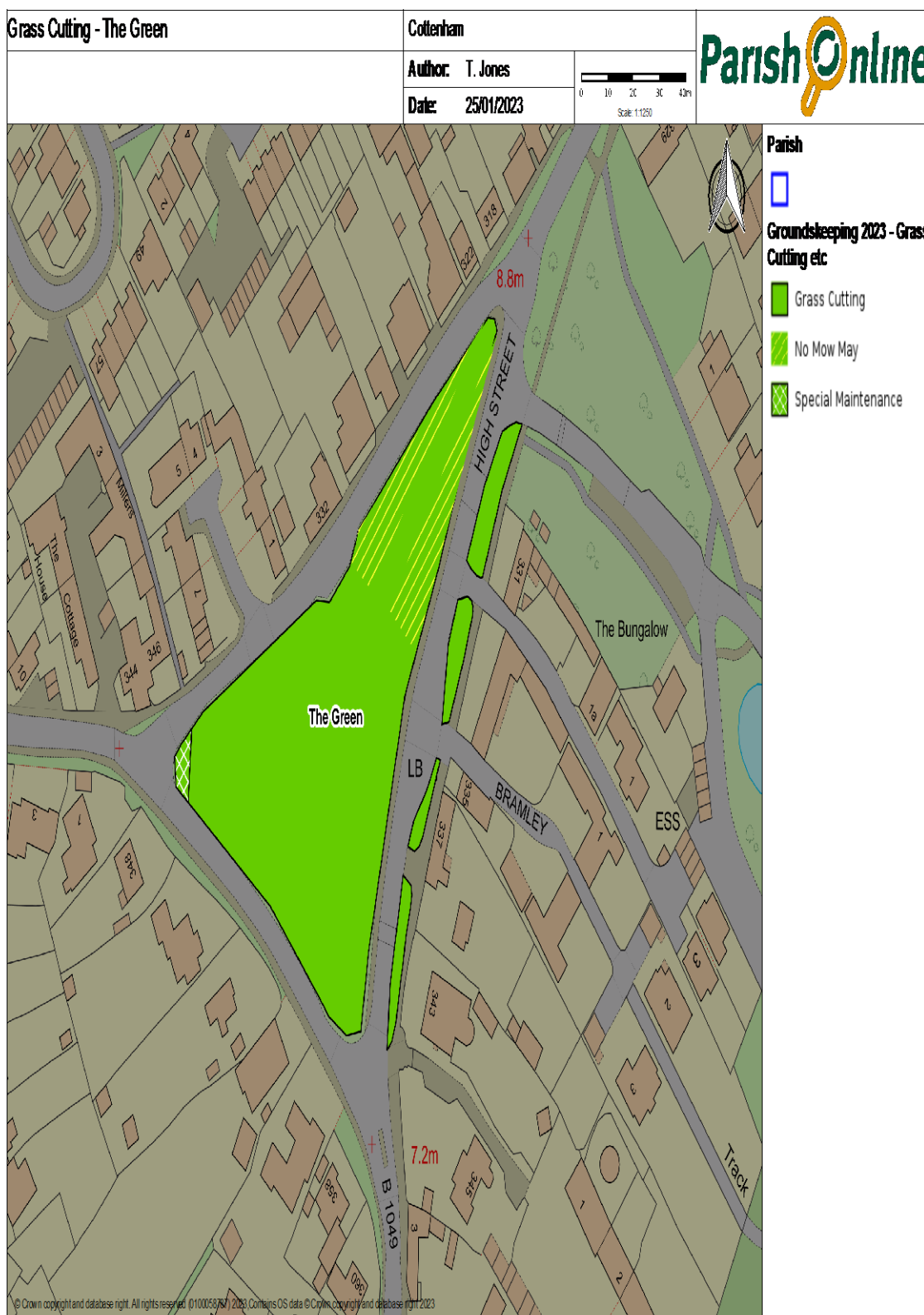
Map 2: Grass Cutting Detail – The Green