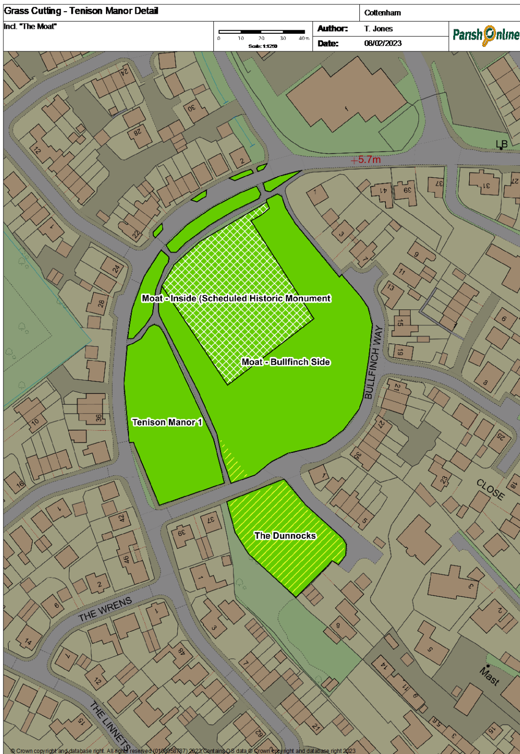
Map 4: Grass Cutting Detail – Tenison Manor