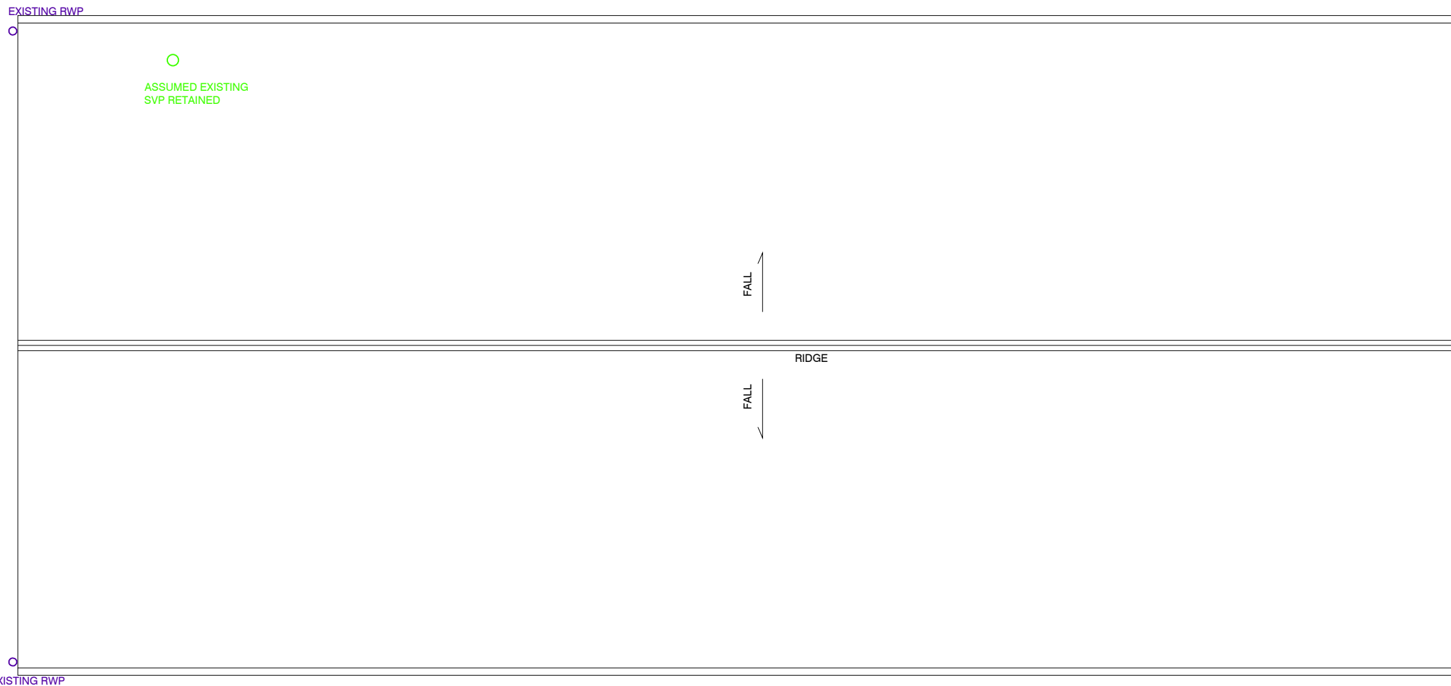
GA roof plan - no changes Scale 1:50@A1

LOFT: MAKE GOOD EXISTING ROOFING MEMBRANE. LAY 2 LAYERS OF MINERAL WOOL INSULATION QUILT AT CEILING LEVEL. GAP BETWEEN WALL PLATE AND INSULATION ABOVE RAFTERS FILLED WITH INSULATION AND PROPRIETARY EAVES VENTILATOR TO ACHIEVE MIN.25mm/m² VENTILATION AT EAVES